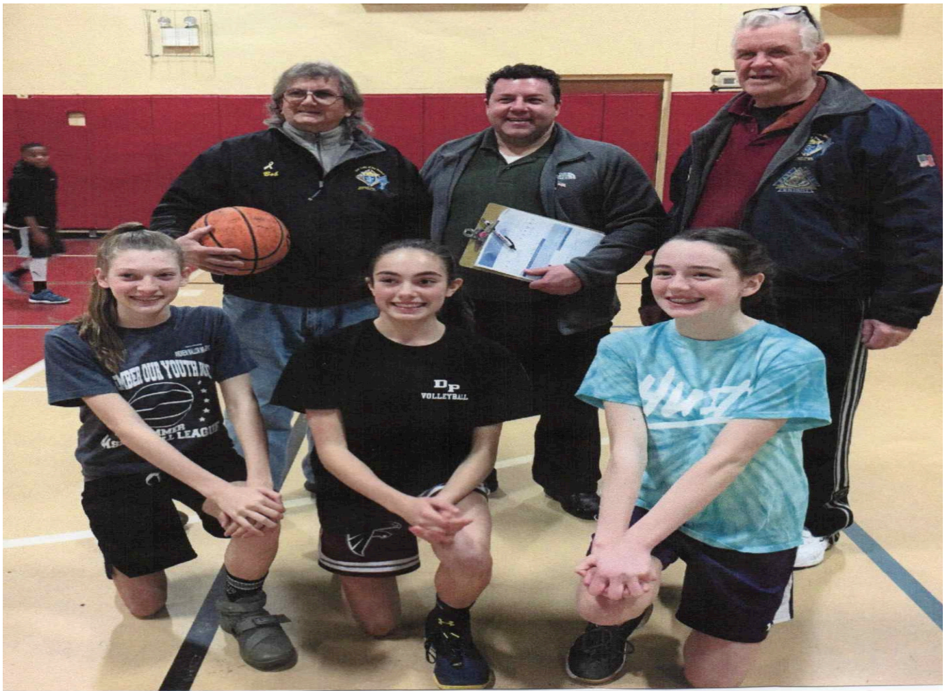
Girl Winners of Free Throw Contest

Our Lady of the Rosary Lenten Mass and Joint Pot Luck Luncheon Columbiettes – Knights – Corporation SUNDAY MARCH 11, 2018 11:00 AM Mass Saint Cyril & Methodius Followed with Lunch at Council Costs $11.00 per person and bring a dessert