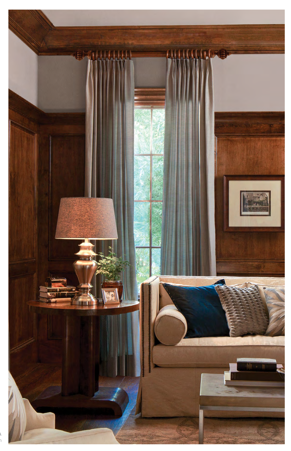
ARMADA Tortoise Shown