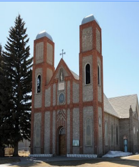
Our Lady of Guadalupe Parish Oldest Parish in Colorado Established in 1857