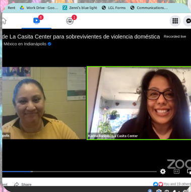
Screenshot of Mexican Consulate