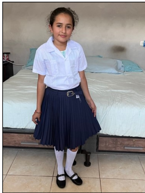
The new uniform! It's the same for all public school students in Honduras.