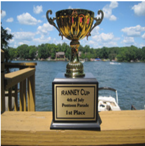
Ranney Cup – 1 st Place Pontoon Parade