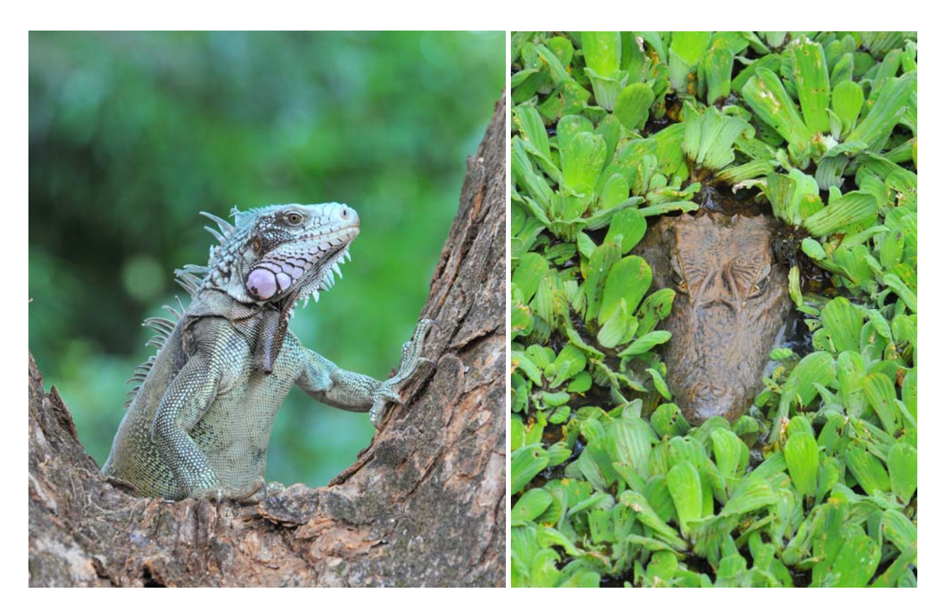
Iguana; Spectacled Caiman

Highlights on the dirt roads around the 80,000 hectare property included incredible numbers of Yellow-knobbed Curassow, innumerable water birds and Spectacled Caiman congregated around the few remaining ponds, Cunaguaro (Ocelot) seen on night safaris and the Jaguar that we were convinced we smelt and heard on a night time stake-out and the Jaguar paw prints and remnants of the its Side-Neck and Snapping Turtle feast we found at Caño San Geronimo. Thanks to the efforts of our crocodile-hunting guide Ricardo, we were able to pose for photos holding a two foot long baby Spectacled Caiman. Not to be outdone, Alejandro Nagi demonstrated how to catch a Pauraque Nightjar (armed with nothing more than a torch) which we admired before it too was released unharmed.