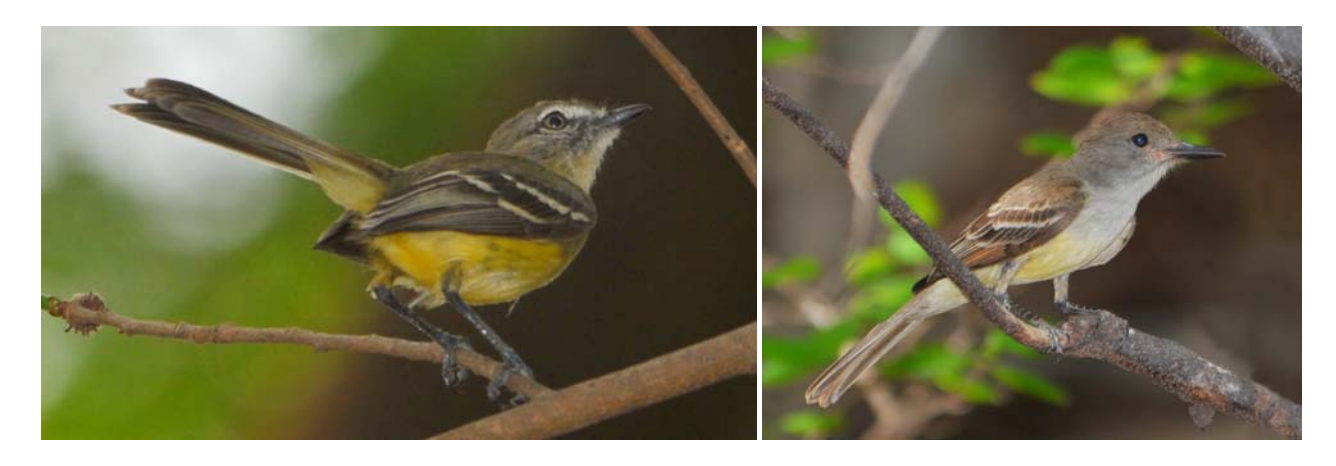
White-tipped Inezia; Brown-crested Flycatcher