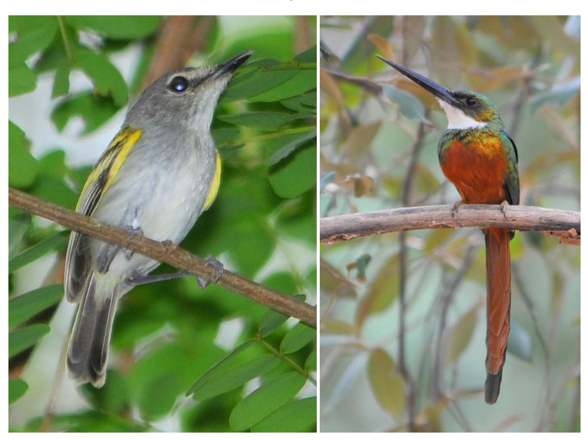
{\it Slate-headed\ Tody-Flycatcher;\ Rufous-tailed\ Jacamar}