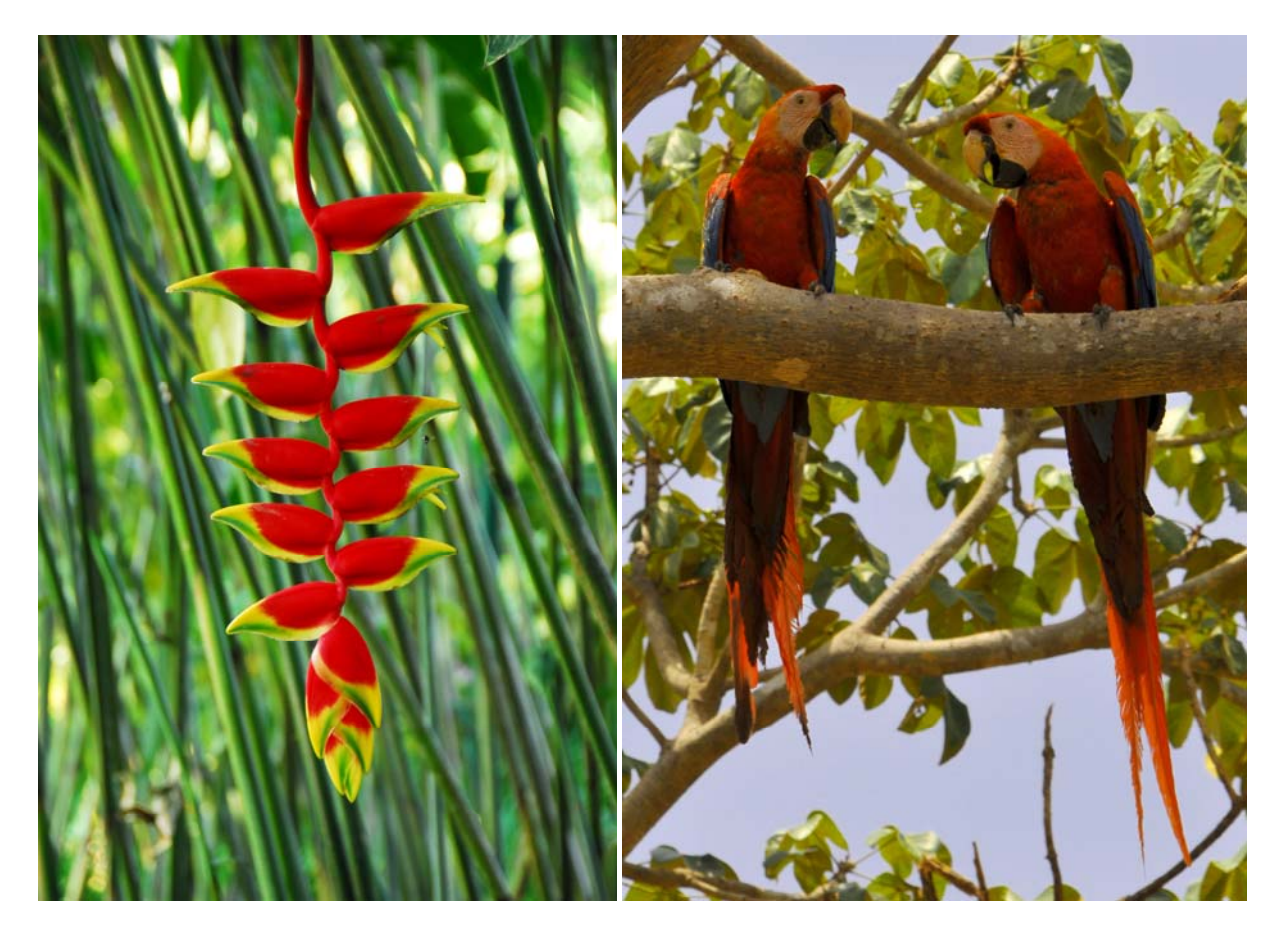
Heliconia at La Estancia, Caracas; Scarlet Macaws

Hato Piñero is some 4½ hours drive from Caracas and we started birding the entrance road around midday, where we soon saw Chestnut-vented Conebill and Crane Hawk at close range. A great start before we had even reached the lodge. That afternoon and the following two days we combined a series of mid-afternoon and pre-dawn, self-guided birding trips with the scheduled 8-11 am and 4-8pm guided nature observation trips on one of the Hato's safari trucks. Due to the lack of water we were unable to make boat trips on any of the Caños. The lodge was excellent, with the food much improved from our last trip in 2003 and the evening Cuba Libras from the open bar flowing liberally, whilst the guides were engaging and enthusiastic.