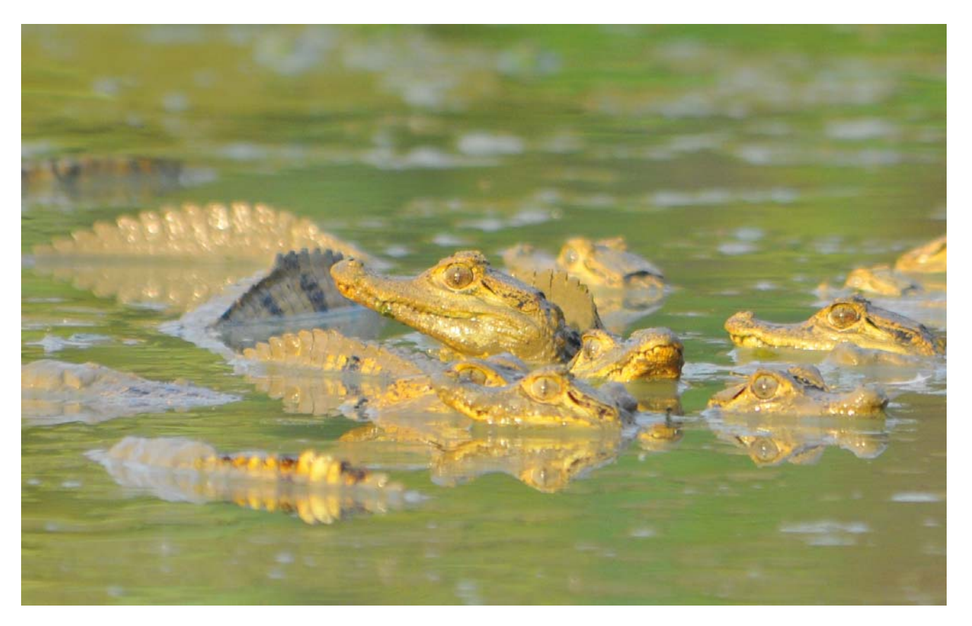
Baby Spectacled Caiman at sunset