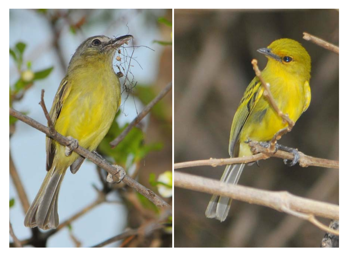
Yellow-olive Flatbill; Ochre-lored Flatbill