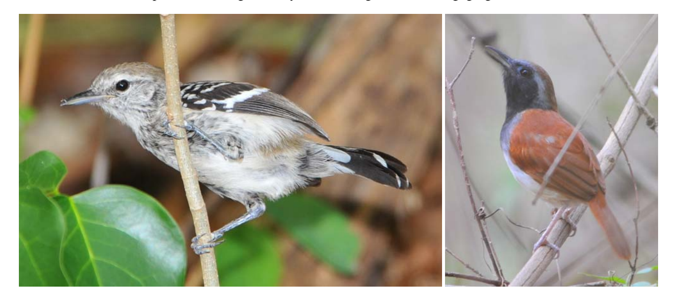
Northern White-fringed Antwren (f); White-bellied Antbird

Hato Piñero is some 4½ hours drive from Caracas and we started birding the entrance road around midday, where we soon saw Chestnut-vented Conebill and Crane Hawk at close range. A great start before we had even reached the lodge. That afternoon and the following two days we combined a series of mid-afternoon and pre-dawn, self-guided birding trips with the scheduled 8-11 am and 4-8pm guided nature observation trips on one of the Hato's safari trucks. Due to the lack of water we were unable to make boat trips on any of the Caños. The lodge was excellent, with the food much improved from our last trip in 2003 and the evening Cuba Libras from the open bar flowing liberally, whilst the guides were engaging and enthusiastic.