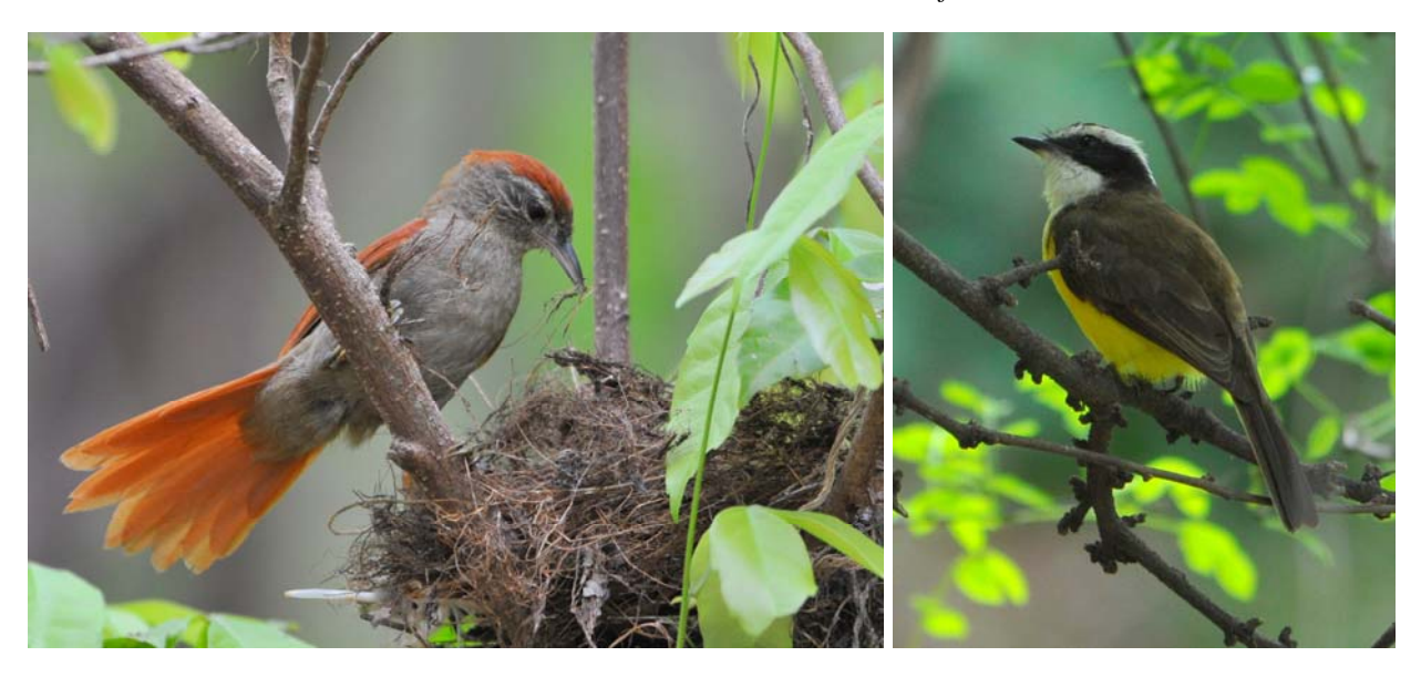
Rusty-backed Spinetail and nest; White-bearded Flycatcher

Other memorable sightings included a Blue-gray Tanager and Glaucous Tanager providing a perfect comparison of the brighter wings of the former and darker head of the latter as they perched next to each other at the edge of the Cojedes River, a Great Horned Owl perched after dusk on a palm in the dry savannah, mixed flocks of Black-bellied and White-faced Whistling Ducks surrounding the eastern ponds and the sunset-light enhanced orange-red of the Scarlet Ibis. An addition to the species listed in the October 2005 'Field Checklist of the Birds of Hato Piñero' was the Yellow-billed Cuckoo seen on several occasions in dry forest at both La Escorsonera and Caño San Geronimo. Mammals seen included Capuchin Monkeys in tall, dry forest (who performed very aggressively when they heard the iPod Jaguar calls) and Red Howler monkeys in gallery forest across the Cojedes River. Emma also enjoyed prolonged close-up views of an Ocelot during a morning horse ride.