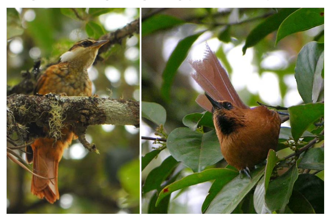
Streaked Tuftedcheek; Black-throated Spinetail

one of the many calling Chestnut-crowned Antpittas that flew onto an open perch to check us out. Although the extensive chusquea bamboo stands were teeming with endemic Black-throated Spinetails and the usual warbler suspects (Three-stripped and Black-crested) we failed (again) to find David M-K's key target, the elusive Plushcap. At least Caracas Tapaculos responded to playback, but unfortunately failed to show.