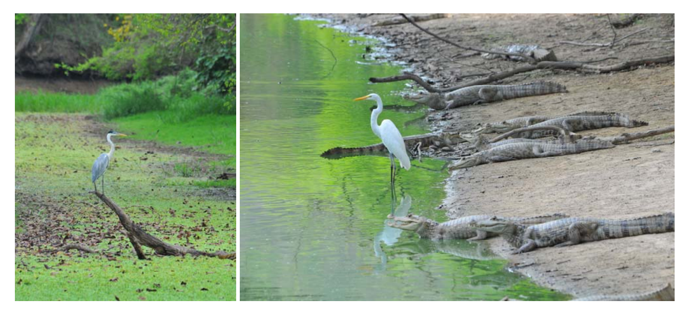
Cocoi Heron at Caño San Geronimo; Great Egret and Spectacled Caiman

Highlights on the dirt roads around the 80,000 hectare property included incredible numbers of Yellow-knobbed Curassow, innumerable water birds and Spectacled Caiman congregated around the few remaining ponds, Cunaguaro (Ocelot) seen on night safaris and the Jaguar that we were convinced we smelt and heard on a night time stake-out and the Jaguar paw prints and remnants of the its Side-Neck and Snapping Turtle feast we found at Caño San Geronimo. Thanks to the efforts of our crocodile-hunting guide Ricardo, we were able to pose for photos holding a two foot long baby Spectacled Caiman. Not to be outdone, Alejandro Nagi demonstrated how to catch a Pauraque Nightjar (armed with nothing more than a torch) which we admired before it too was released unharmed.