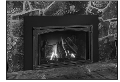
Direct Vent Gas Inserts