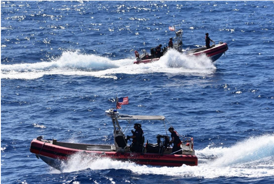
NORTHLAND crew conducting small boat operations and training.