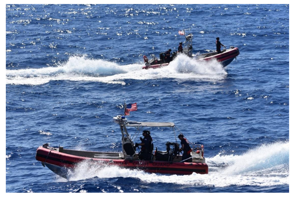
NORTHLAND crew conducting small boat operations and training.