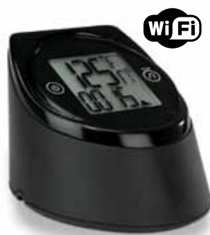
ET-736 WIFI ROASTING THERMOMETER App Driven Thermometer Dual Probes, Recipe Storage Unlimited Timers