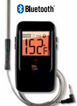
ET-735 BLUE TOOTH BBQ THERMOMETER 160 Foot Range 2 Hybrid Water-Proof Probes