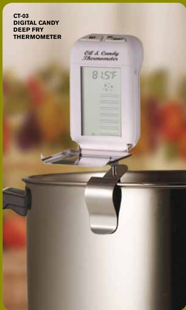
CT-03 DIGITAL CANDY DEEP FRY THERMOMETER