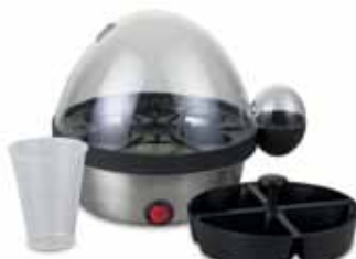
EC-200 STAINLESS STEEL EGG COOKER Soft, Medium or Hard Boils up to Seven Eggs Measuring Cup Included Poaching Tray for Four Eggs