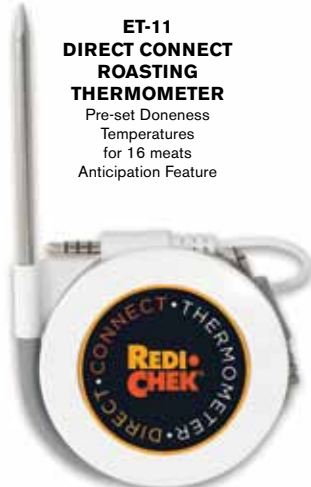
ET-11 DIRECT CONNECT ROASTING THERMOMETER Pre-set Doneness Temperatures for 16 meats Anticipation Feature