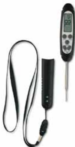
DT-09C FAST READ DIGITAL PROBE Handle and Protective Sleeve Waterproof • 1.7mm Tip -58°F to +572°F / -58°C to +300°C Available in red