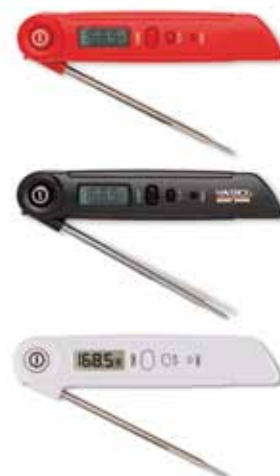
DT-13 FLIP TIP INSTANT READ Available in Red, Black, White +32°F to +572°F / 0°C to +200°C