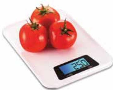
KS-02 KITCHEN SCALE Measures Fluid Ounces 7 lbs. Capacity