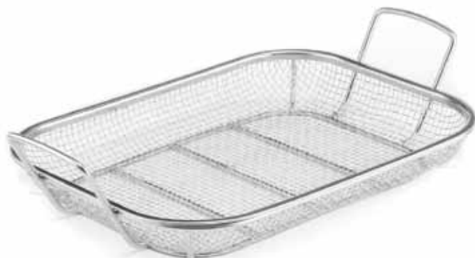
MRP-01C STAINLESS STEEL MESH ROASTING PAN