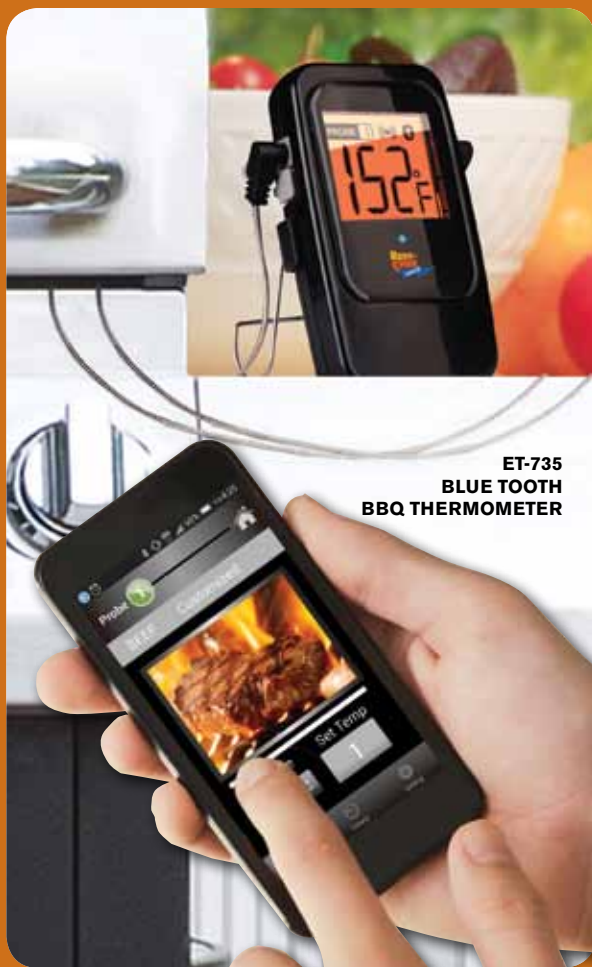
ET-735 BLUE TOOTH BBQ THERMOMETER