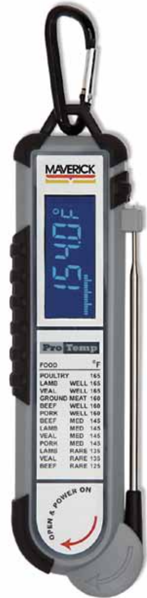
PT-100BBQ RED Thermocouple Technology 1F Degree Accuracy / 3 Second Response Belt Clip Included -40°F to +450°F / -40°C to +232°C