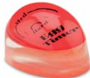
TM-100 IN WATER EGG TIMER