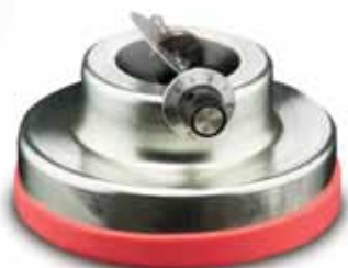
TTT-01 TIP TOP TEMP Perfect for Low and Slow Cooking Automatically Regulates the Temperature