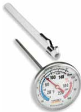
IRT-02 LARGE DIAL INSTANT READ 2" DIAL WITH SLEEVE 0°F to +220°F / -10°C to +100°C