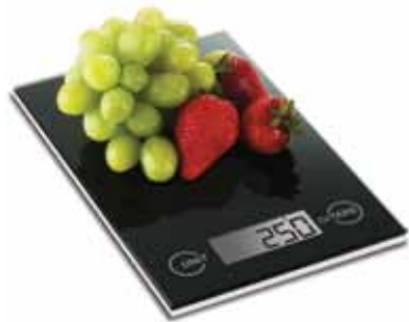
KS-03 KITCHEN SCALE Tempered Glass Top 11 lbs. Capacity