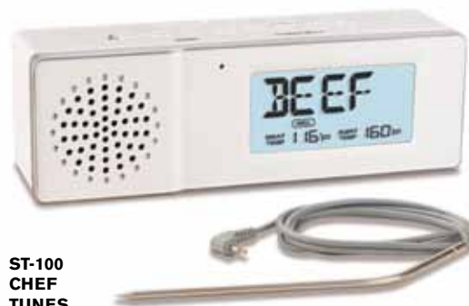
ST-100 CHEF TUNES Blue Tooth Speaker, Hands Free Phone & Roasting Thermometer Available in white and black