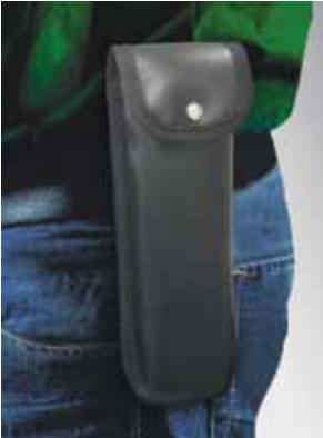
PT-100H PRO TEMP THERMOMETER CARRYING CASE