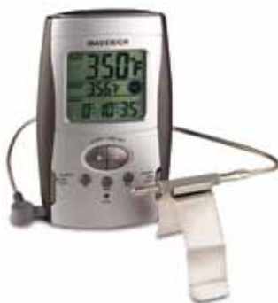
OT-03 DIGITAL OVEN THERMOMETER Computes Average Oven Temperature +122°F to +572°F / +50°C to +300°C