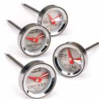
RT-04 SET OF FOUR MINI THERMOMETERS Two Beef Coded R, M, W Two Chicken