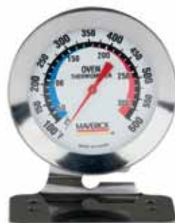
OT-02 LARGE DIAL OVEN THERMOMETER Color Coded Dial +100°F to +600°F / +50°C to +300°C