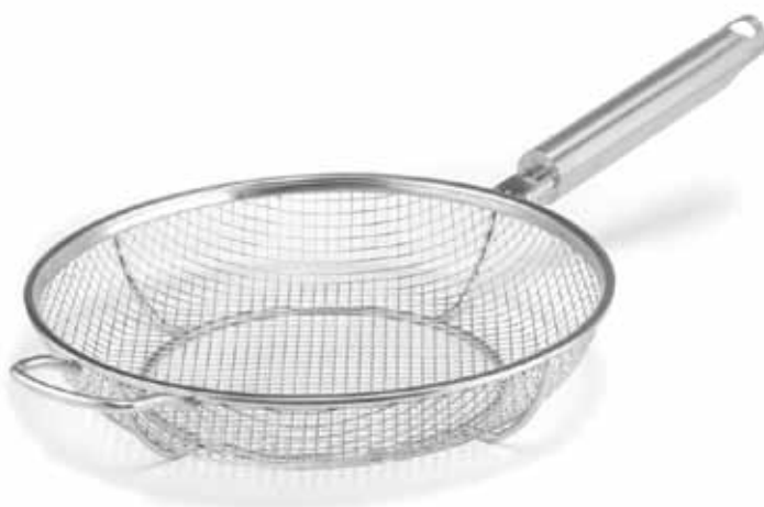
MFP-01CR STAINLESS STEEL MESH FRY PAN Removable Handle