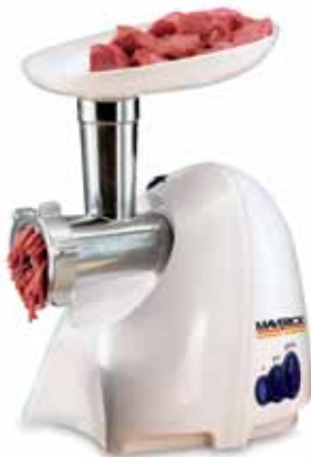
MM-5501 DELUXE MEAT GRINDER Reversible Motor / 550 Watts Auto Reset