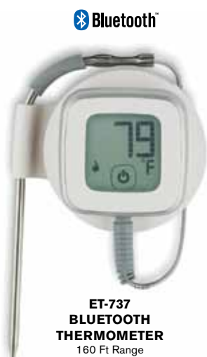
ET-737 BLUETOOTH THERMOMETER 160 Ft Range Easy Storage