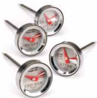
RT-04 SET OF FOUR STEAK & CHICKEN MINI THERMOMETERS