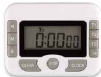
TM-09 FOUR LINE DIGITAL TIMER WITH CLOCK 99 Minute, 59 Second Timer