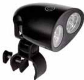
GL-320 10 LED GRILL LIGHT