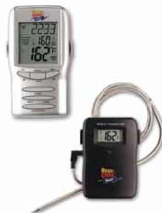
ET-72 SINGLE PROBE REMOTE 100 Ft Range Timer Includes Pre-Select Meat and Taste +14°F to +410°F / -10°C to +210°C