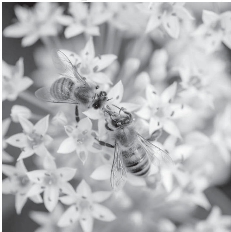
Bee populations are very important to our food security.

A colorful garden in full bloom is an aesthetically appealing sight each spring and summer. The pleasant aromas emanating from such spaces only add to their appeal.