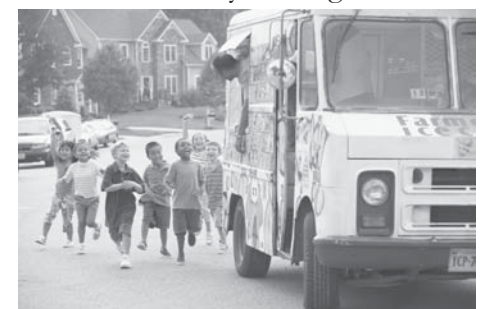
Chasing the ice cream truck.

Also, ask any kids and sometimes ice cream tastes better if you have to run to the ice cream truck. Listen and look for them in your neighborhood!