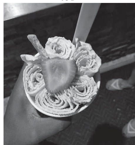
Rolled ice cream.

Watching ice cream get made and end up looking like a piece of art is what happens at NatuRoll Creamery on Butler Street. There are so many flavor choices and toppings that your cravings will be met! Info naturollcreamerypg.com .