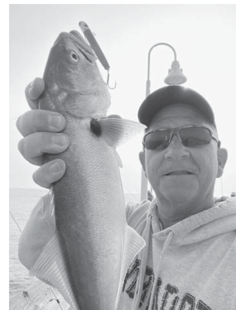
Bluefish from Sandbridge Beach Pier.

There is no way I would have bought that lure if Matt had not wanted that caramel and the bait shop would have not been out of bloodworms. Not in a million years. Keep those lines tight, and send your pictures and stories to samdhall@comcast.net , and try one of those Cow Tales, they are delicious!