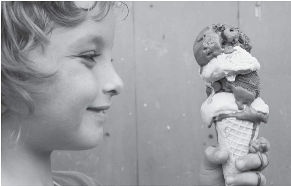
Enjoy some ice cream during National Ice Cream Month.

Temperatures are steady in the 80's and in true Pittsburgh form, the sunny, hot and humid days will be the backdrop for most of July's fun. Outside activities are in abundance and escaping to indoor air conditioned activities will be an option as well.