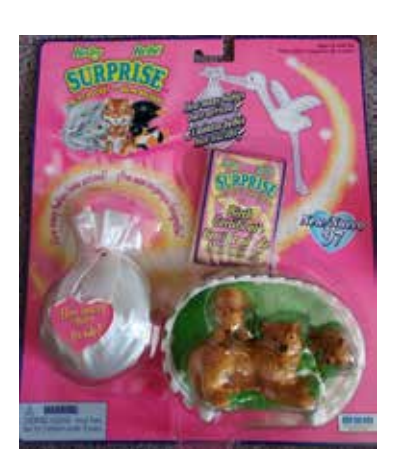
Type D - Mexico In packs