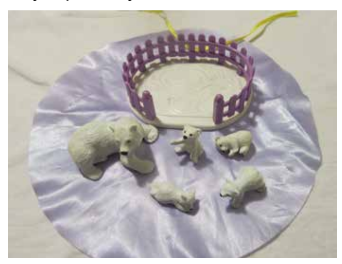
From Canada, instead of brown bears