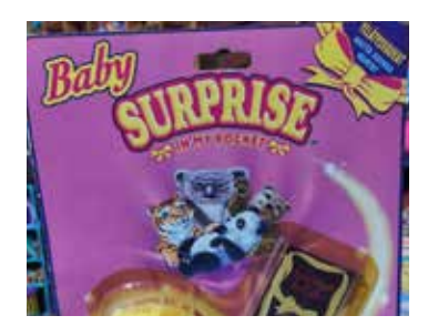
Type K - Scandinavian (no pic) In packs