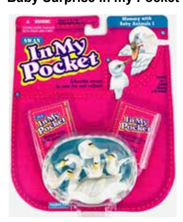
Type C - USA (Hasbro) In packs