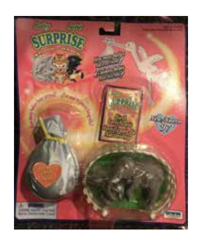
Type A - USA (Irwin) In packs