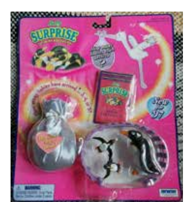
Silk bag not always same colour