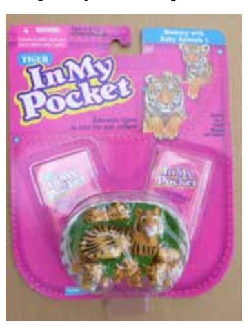
Type C - USA (Hasbro) In packs