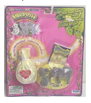
Type J - UK only In packs