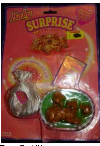
Type G - UK In packs