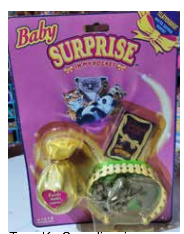
Type K - Scandinavian In packs