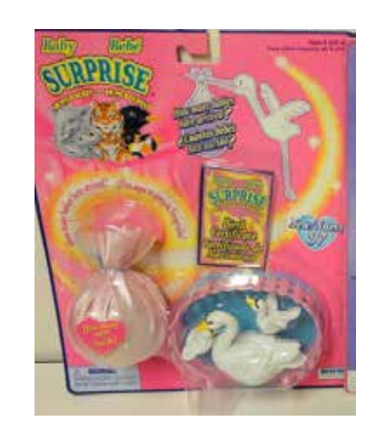
Type A - USA (Irwin) In packs