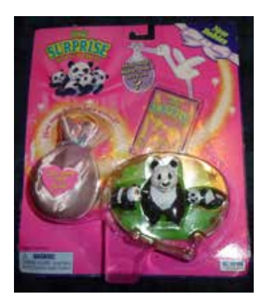
Silk bag not always same colour