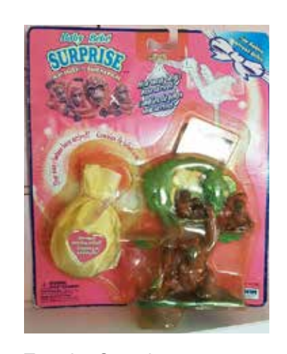
Type E - USA (no pic) In packs