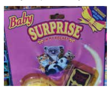
Type K - Scandinavian (no pic) In packs