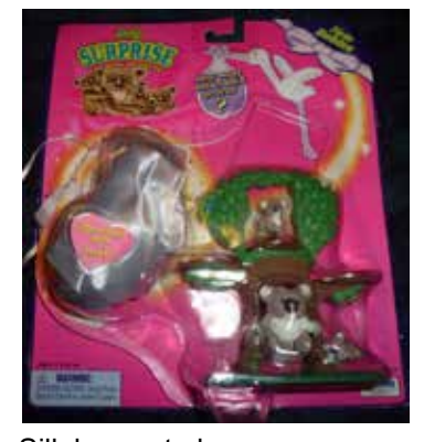
Silk bag not always same colour