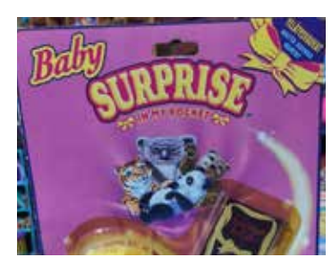
Type K - Scandinavian In packs