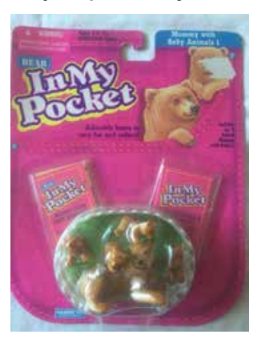
Type C - USA (Hasbro) In packs