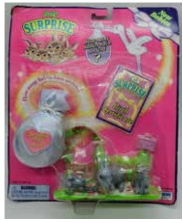
Silk bag not always same colour