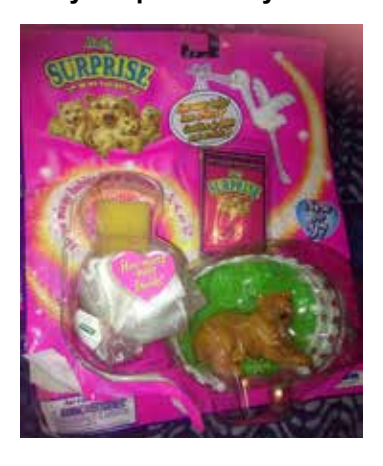
Type A - USA (Irwin) In packs