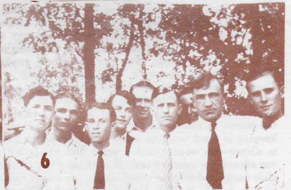
1., 2., and 6. Bethpage Campmeeting, 1929. 3. Wichita, Kansas Young People 4. Elmwood, Oklahoma Campmeeting 1934. 5. Meade, Kansas Campmeeting, 1931.