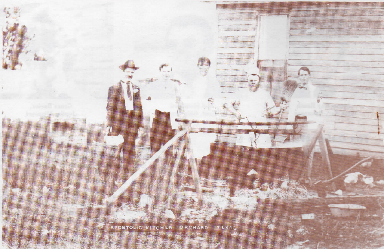
APOSTOLIC KITCHEN ORCHARD TEXAS