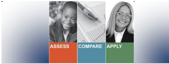
Kanawha County, West Virginia Behavioral Health Indicators and Priorities