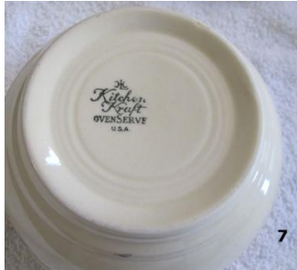
Picture 7 is the back of the bowl with the floral decal (picture 6).