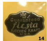
Picture 14 --- (*) An image found online of what the foil label looks like.

These bowls are fun to collect, and also it shows how the creativity of the designers of these bowls as they could be mixed and matched with various Homer Laughlin dinnerware lines throughout the 1940s and 50s. The bowls were generally shaped identically, but sometimes through the years there could be minor variations in the molds (mostly I am told on the rim of the bowl.)