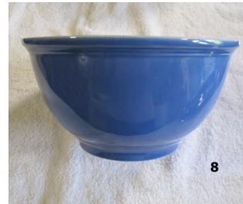
Picture 8 is the only uniquely Harlequin color in the photos. This color is Mauve Blue. (1937- early 1950s)