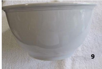
Picture 9 Is a large grey bowl that is from the Jubilee line. (Late 1940s and early 1950s) It would also work with Fiesta and Harlequin as grey was a color for these dishes in the 1950s.