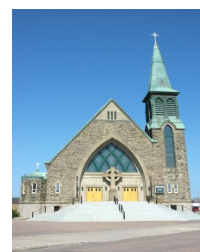
Saint Augustine's 340 Dominion Street Moncton, NB

July 1, 2018 Thirteenth Sunday in Ordinary Time