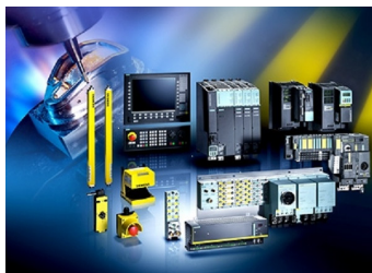
Industrial Electronics Repair