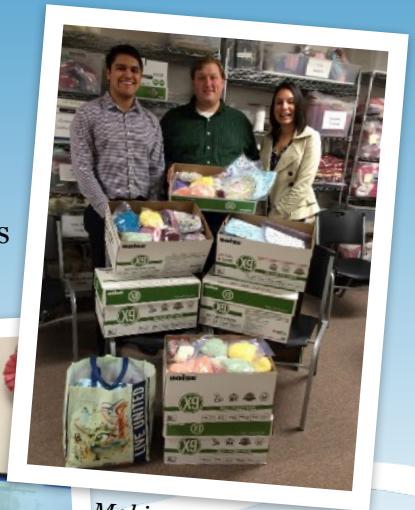
Making a Delivery