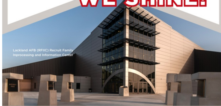
Lackland AFB (RFIC) Recruit Family Inprocessing and Information Center

Cram Roofing provides the very best value in long-term roofing solutions to commercial building owners