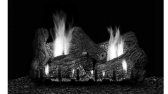
Radiant Heat Gas Logs