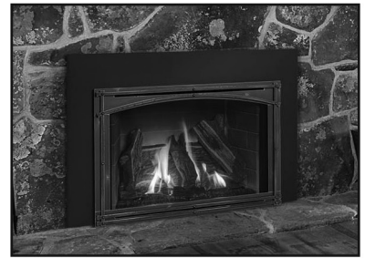
Direct Vent Gas Inserts