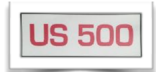
Tribute to our friend and mentor,