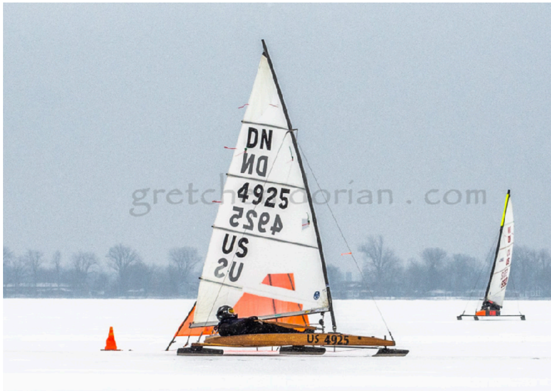
A Sample Gretchen Dorian Photo https://www.gretchendorian.com

http://dniceboat.org/idniyra/2019NorthAmerican.html