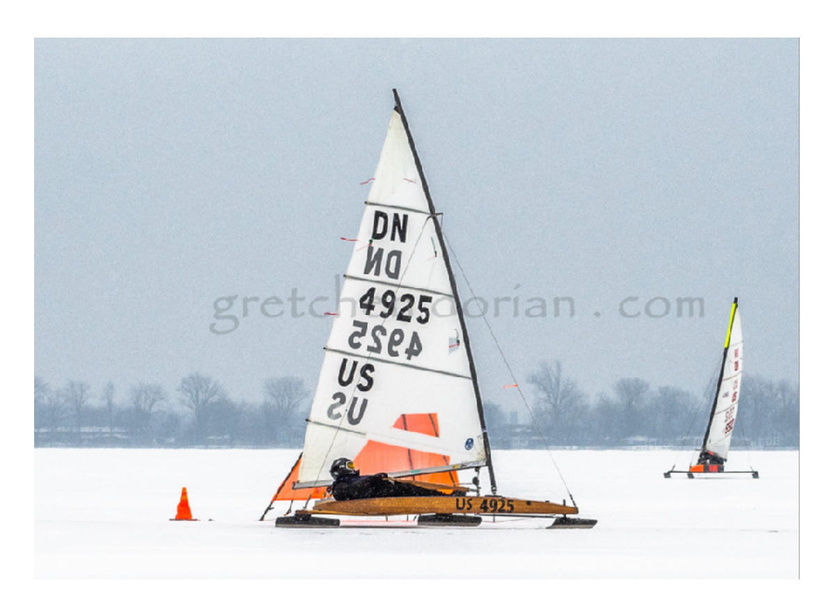
A Sample Gretchen Dorian Photo https://www.gretchendorian.com

http://dniceboat.org/idniyra/2019NorthAmerican.html