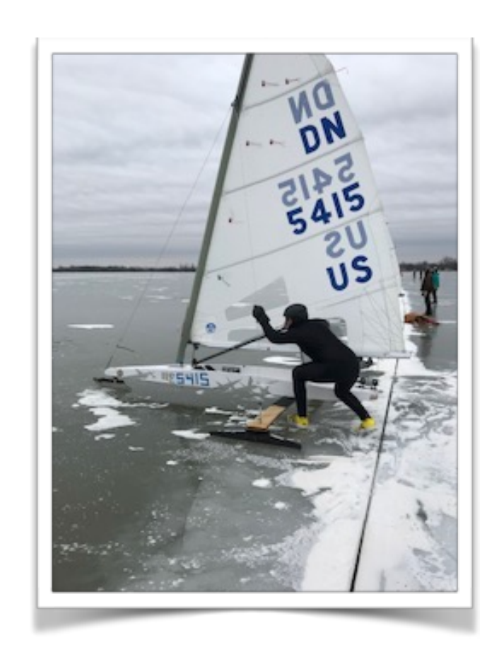
DN Evening Attire Requirements - Gloves & Glue