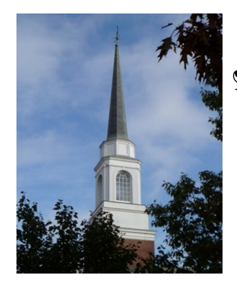
November 2023 Volume 69, No. 11