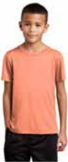
YST420 Sport-Tek® Youth Posi-UV™ Pro Tee