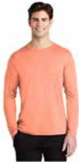
ST420LS Sport-Tek® Posi-UV™ Pro Long Sleeve Tee