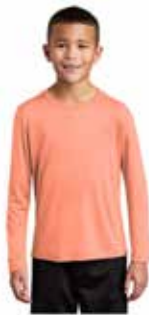
YST420LS Sport-Tek® Youth Posi-UV™ Pro Long Sleeve Tee