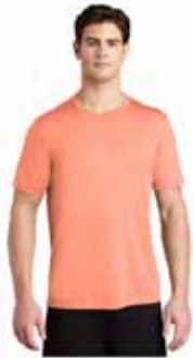
ST420 Sport-Tek® Posi-UV™ Pro Tee

The DEADLINE for T-Shirt orders is September 22, 2021