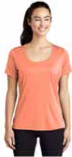
LST420 Sport-Tek® Ladies Posi-UV™ Pro Scoop Neck Tee