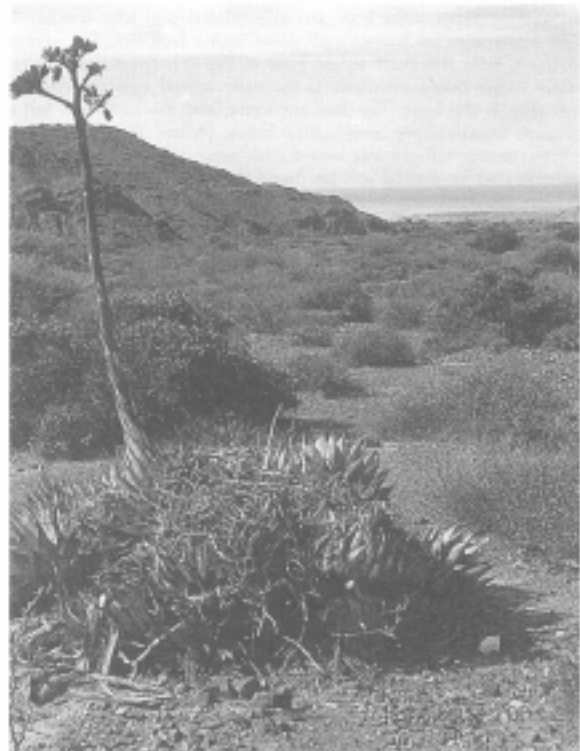
FIG. 4. Nest of Neotoma bryanti in a maguey ( Agave ) and habitat on Cedros Island, Baja California, Mexico.

GENETICS. Phylogenetic analyses using mtDNA sequences and allozyme data have shown that wood rats in the N. lepida group form a distinct clade which may deserve subgeneric recognition. The group consists of at least three species, N. lepida , N. devia ,