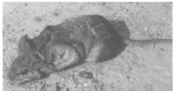
FIG. 1. Adult female Cedros Island wood rat, Neotoma bryanti , from near Cerro Solo, Cedros Island, Baja California, Mexico.

Based upon trapping results, the greatest observed density of N. bryanti was in the dense prickly pear "orchard" at Punta Norte (Mellink-Bijtel, 1992). Ten individuals were captured in 560 trap