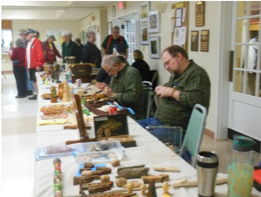
Ct Woodcarvers Club members!