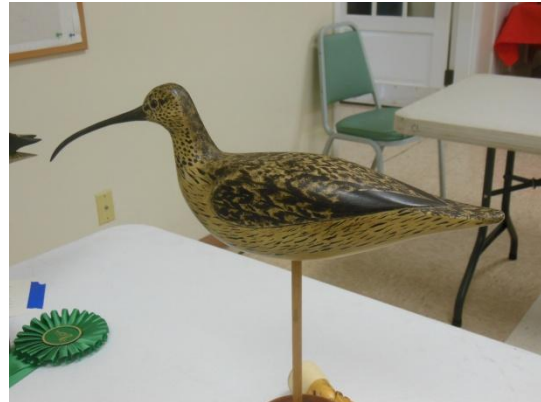
2 nd place prize winner for Smoothies.

Nice job done by all the members who helped to put on the show. Thanks so much. See you all again next year!!!!!!!!!!!!!!!!!!!!!!