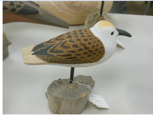
One of Ryan's small birds