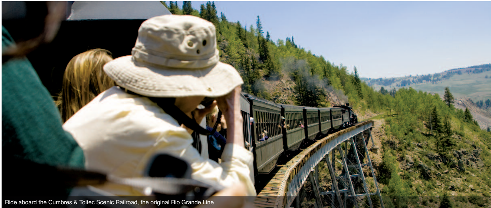
Ride aboard the Cumbres & Toltec Scenic Railroad, the original Rio Grande Line