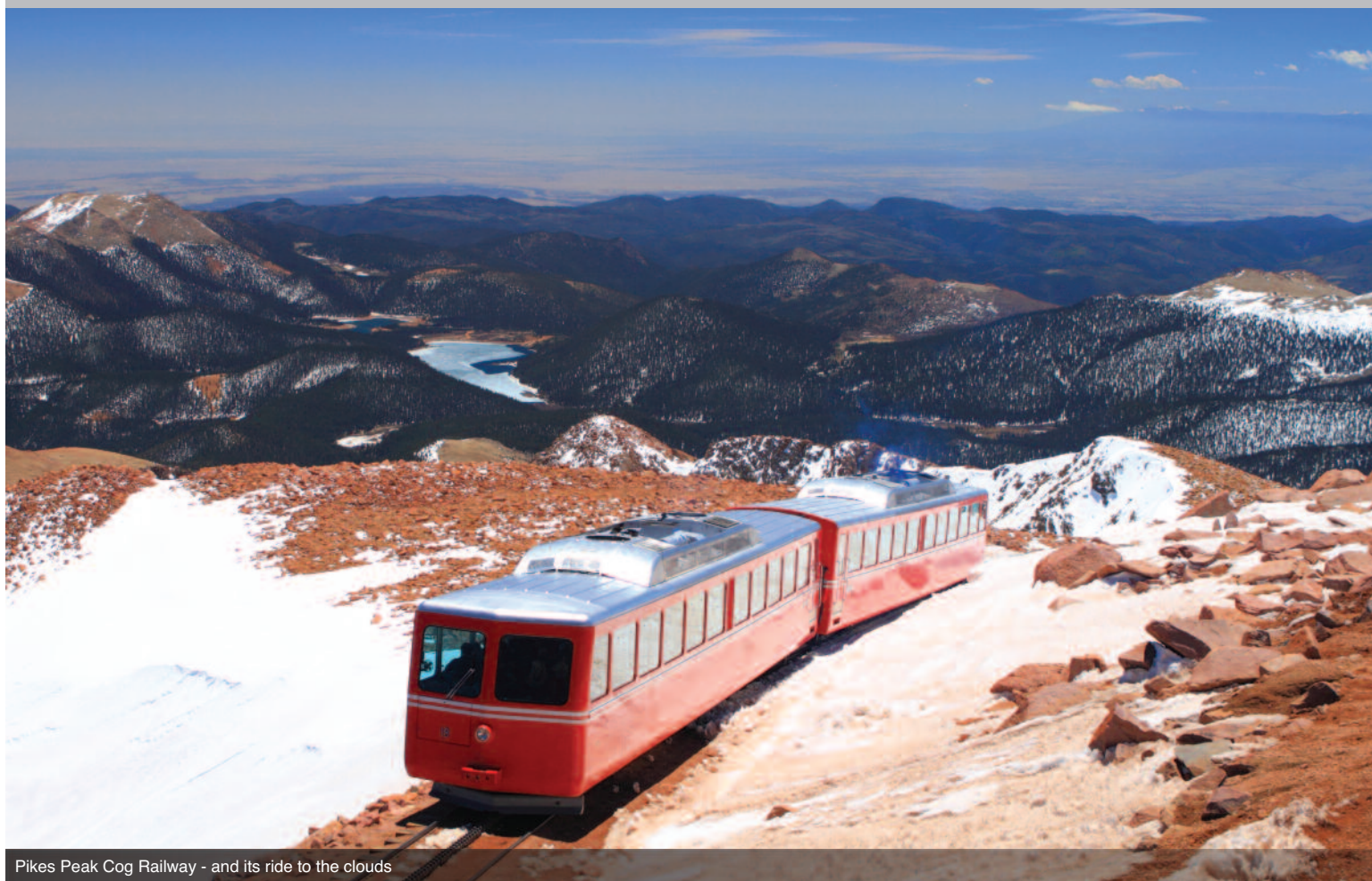
Pikes Peak Cog Railway - and its ride to the clouds