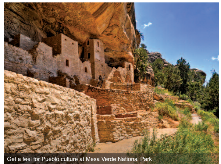
Get a feel for Pueblo culture at Mesa Verde National Park