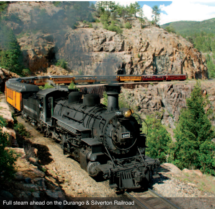
Full steam ahead on the Durango & Silverton Railroad