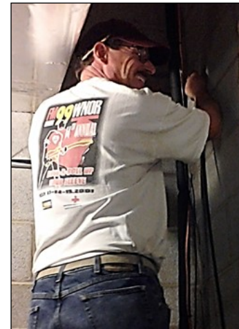
Tall ladders indeed— pulling cables!