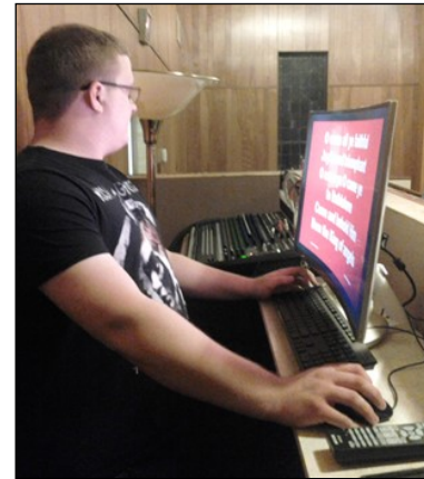
Guy working on the new computer.