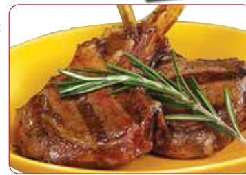
Fresh Lamb Shoulder Chops