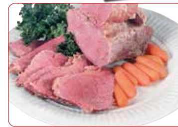
USDA Premium Beef Point Cut Corned Beef