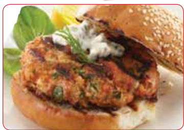
USDA Inspected Ground Turkey Value Pack