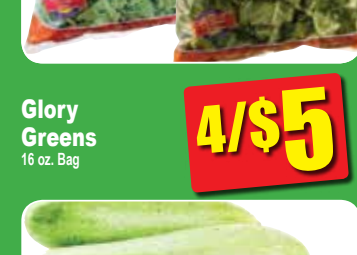
Glory Greens 16 oz. Bag