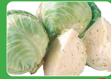
Michigan Green Cabbage