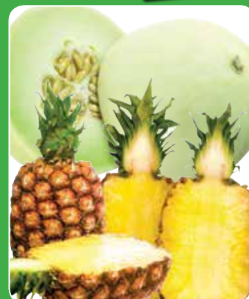
Fresh Honey Dew Melons or Pineapple