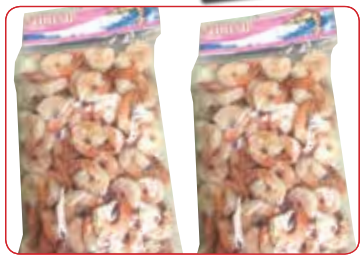
Happy Seas Cooked Shrimp 41 - 50 ct. 2 lb. Bag