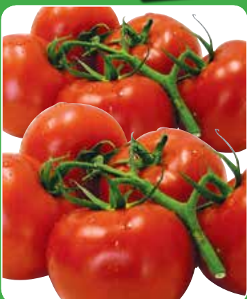
Fresh Tomatoes on the Vine