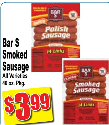
Bar S Smoked Sausage All Varieties 40 oz. Pkg.