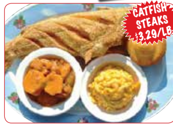
Fresh Whole Catfish