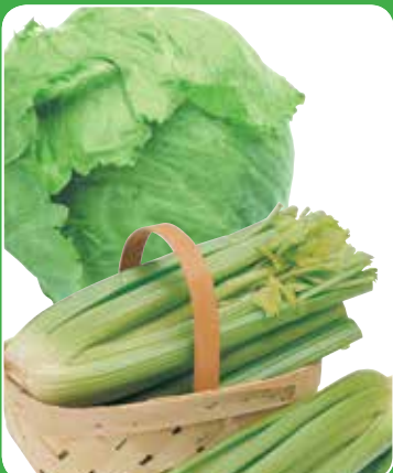
Dole Head Lettuce or Celery