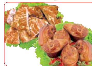
Smoked Neck Bones or Ham Hocks Family Pack