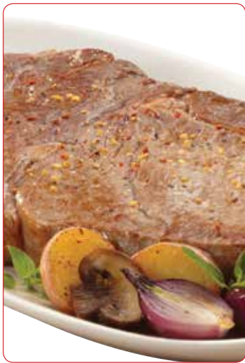
USDA Premium Beef Boneless Chuck Steak Family Pack