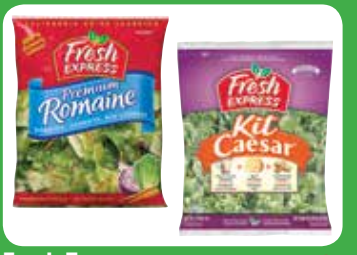
Fresh Express Premium Blends or Kits Salad Mixes 6 - 12 oz. Bag