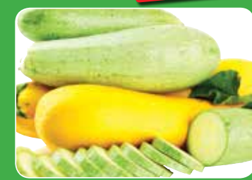
Fresh Zucchini or Yellow Squash