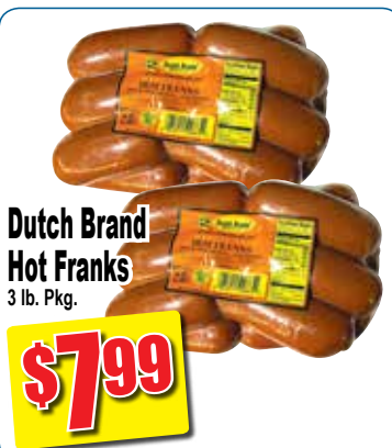
Dutch Brand Hot Franks 3 lb. Pkg.