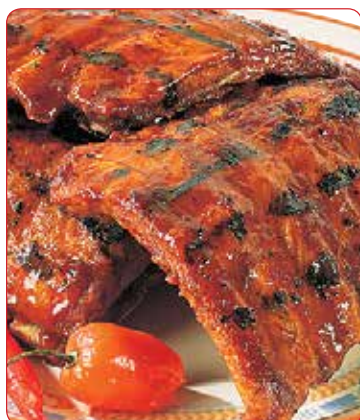
USDA Inspected Baby Back Pork Ribs Single Pack Cryovac