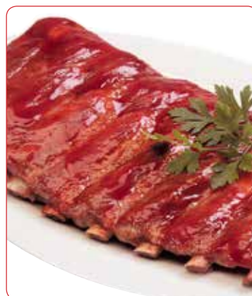
USDA Inspected Pork Spare Ribs 2 Pack Cryovac