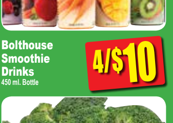
Bolthouse Smoothie Drinks 450 ml. Bottle