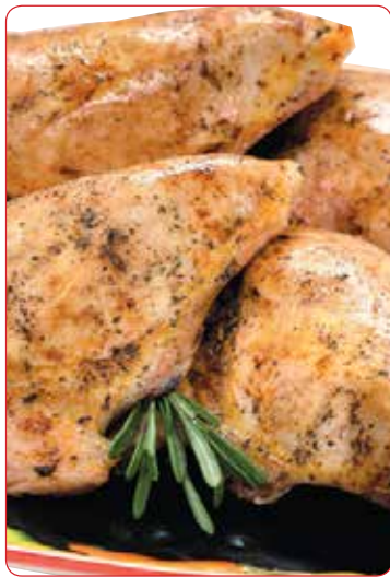
Grade 'A' Fresh Split Chicken Breast Sold in 10 lb. Bags @ $5.90