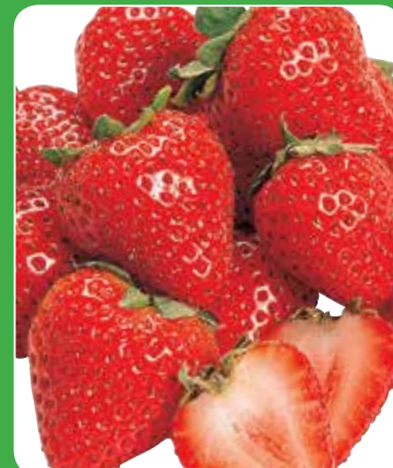
Fresh California Strawberries 1 lb. Pkg.