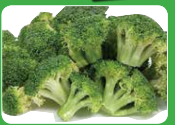
Fresh Broccoli Crowns