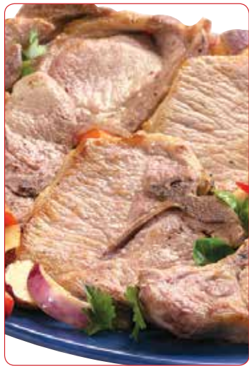
USDA Inspected Assorted Pork Chops Family Pack