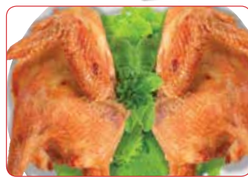
Grade 'A' Fresh Split Chicken