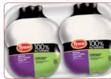
Tyson Cornish Hens Twin Pack