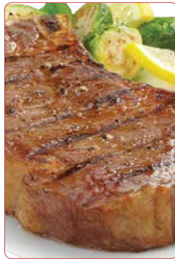
USDA Premium Beef Bone In Ribeye Steaks Family Pack