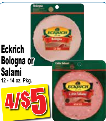
Eckrich Bologna or Salami 12 - 14 oz. Pkg.