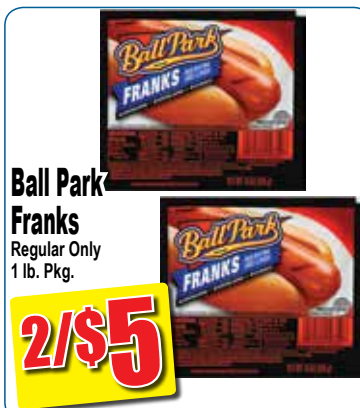
Ball Park Franks Regular Only 1 lb. Pkg.