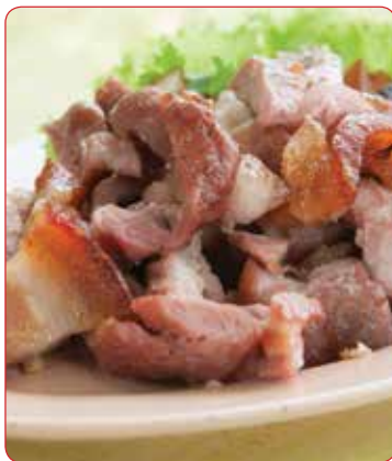
USDA Inspected Pork Neck Bones Value Pack