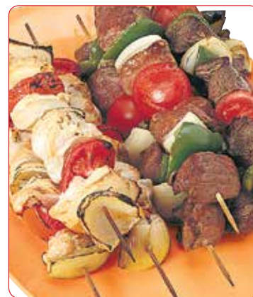
Beef or Chicken Shish Kabobs