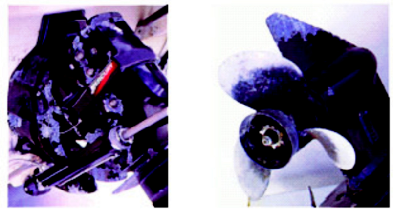
Typical signs of corrosion on marine lower drive units and propellers include blistering paint and th eformation of a white powdery substance on the exposed metal areas

areas. As the corrosion continues, the exposed metal areas will become deeply pitted, as the metal is actually eaten away.