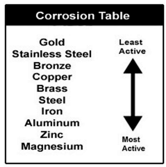
In looking at this chart, you can also see that gold is the least active metal of all metals, however magnesium is the

Hereqs why. Iron atoms want to return to their normal state as iron ore, iron oxide, or rust. Which are all the same things. Thatqs the state in which iron is most comfortable and most stable. Left alone, it wonq turn into anything else. And most metals used in manufactured products want to do the same return to their natural state.