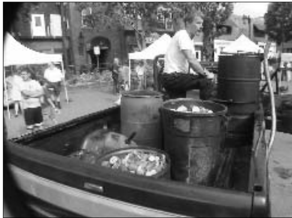
The wood-powered truck

A wood-gas powered truck from 21st Century Motor Works breezed in at 27.7 MPGe