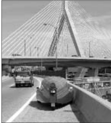
The Dirigo heads over the bridge between Cambridge and Boston.

finished only hours before the race, yet apart from overheating problems, made Boston in fine form.