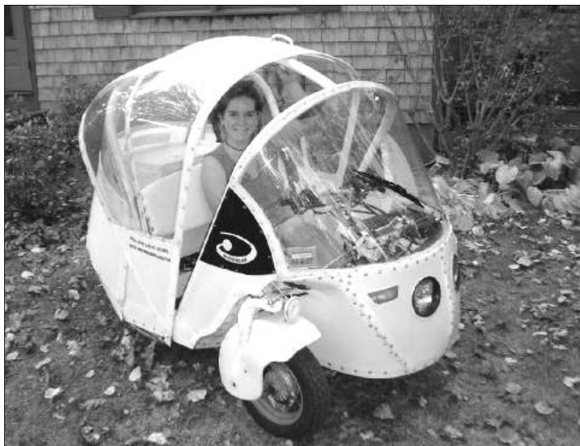
Moonbeam, built in 2006 and winner of the One Gallon Challenge, at home in Camden, MA