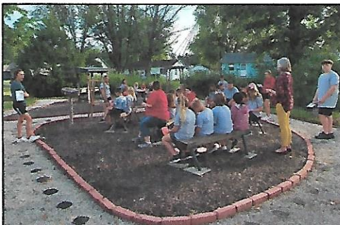
We prayed the Rosary in the Prayer Garden.

REMINDER: Please return all forms to the office that have been sent home in Friday folder.