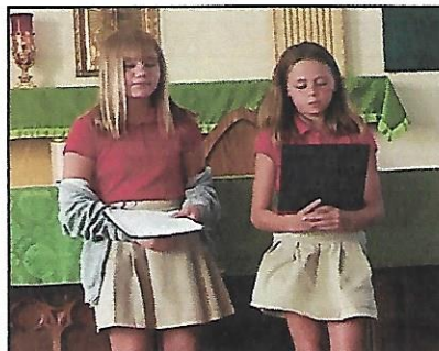
For our Prayer Services on Thursdays, students have been reading and playing the chimes.