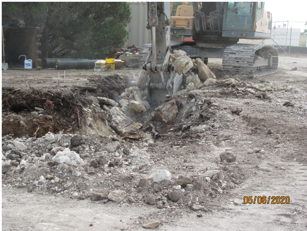
EXHIBIT 16 – SITE EXCAVATION IN ROCK