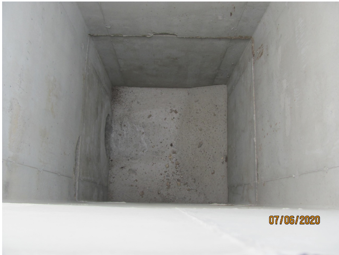
EXHIBIT 19 – STORM DRAIN JUNCTION BOX → SW CORNER OF FACILITY