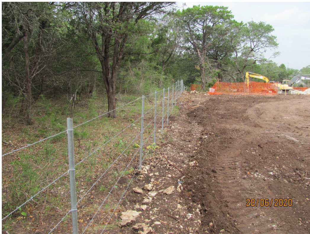
EXHIBIT 11 – 5 STRAND BARB WIRE → SOUTH PROPERTY LINE vs. FENCECRETE