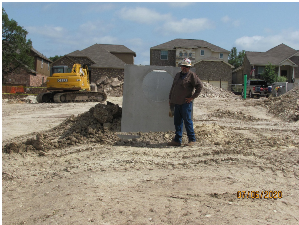
EXHIBIT 18 – STORM DRAIN JUNCTION BOX → SW CORNER OF FACILITY