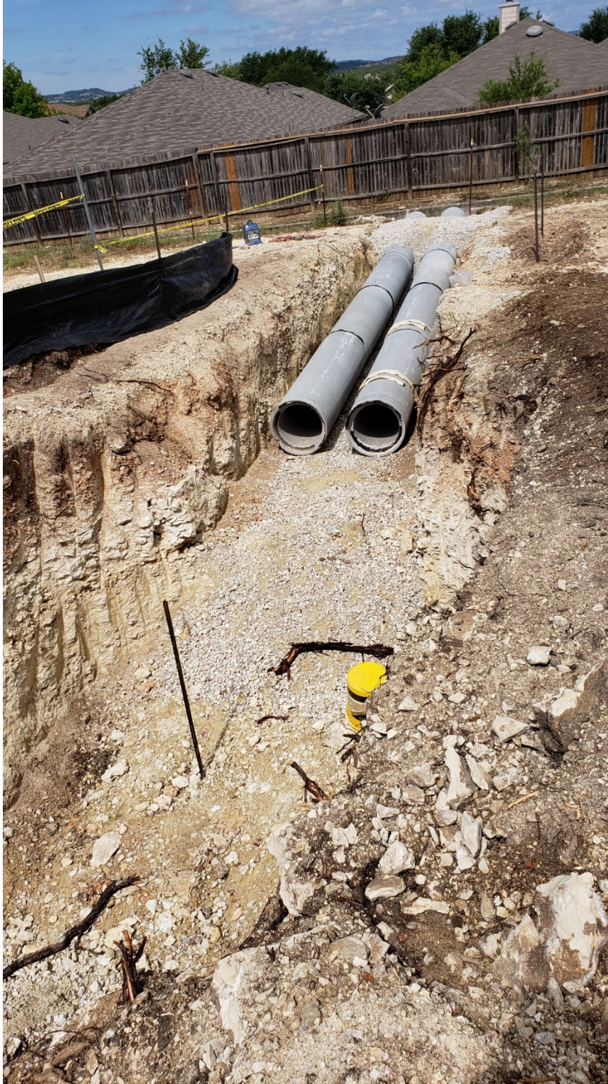
EXHIBIT 7 – STORM DRAIN → WEST IN KLABUNDE EASEMENT