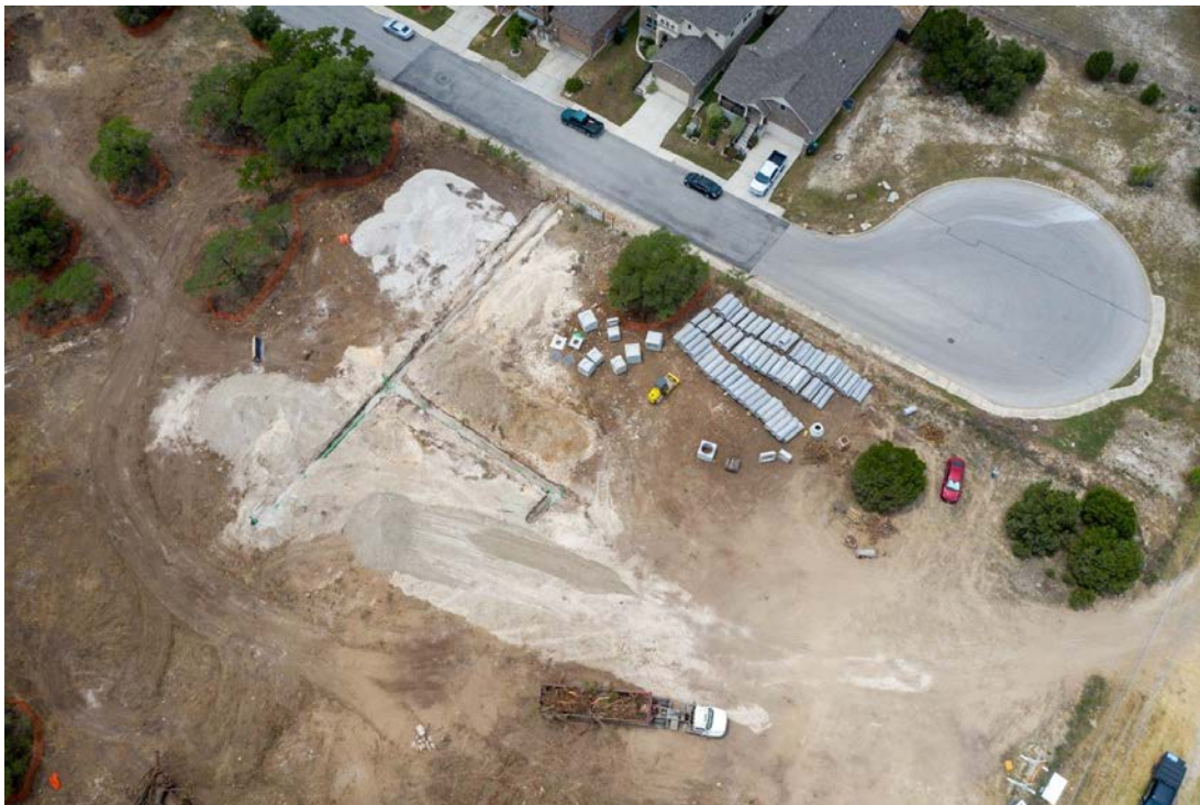
EXHIBIT 2 – SITE CLEARED AS OF 06.23.20