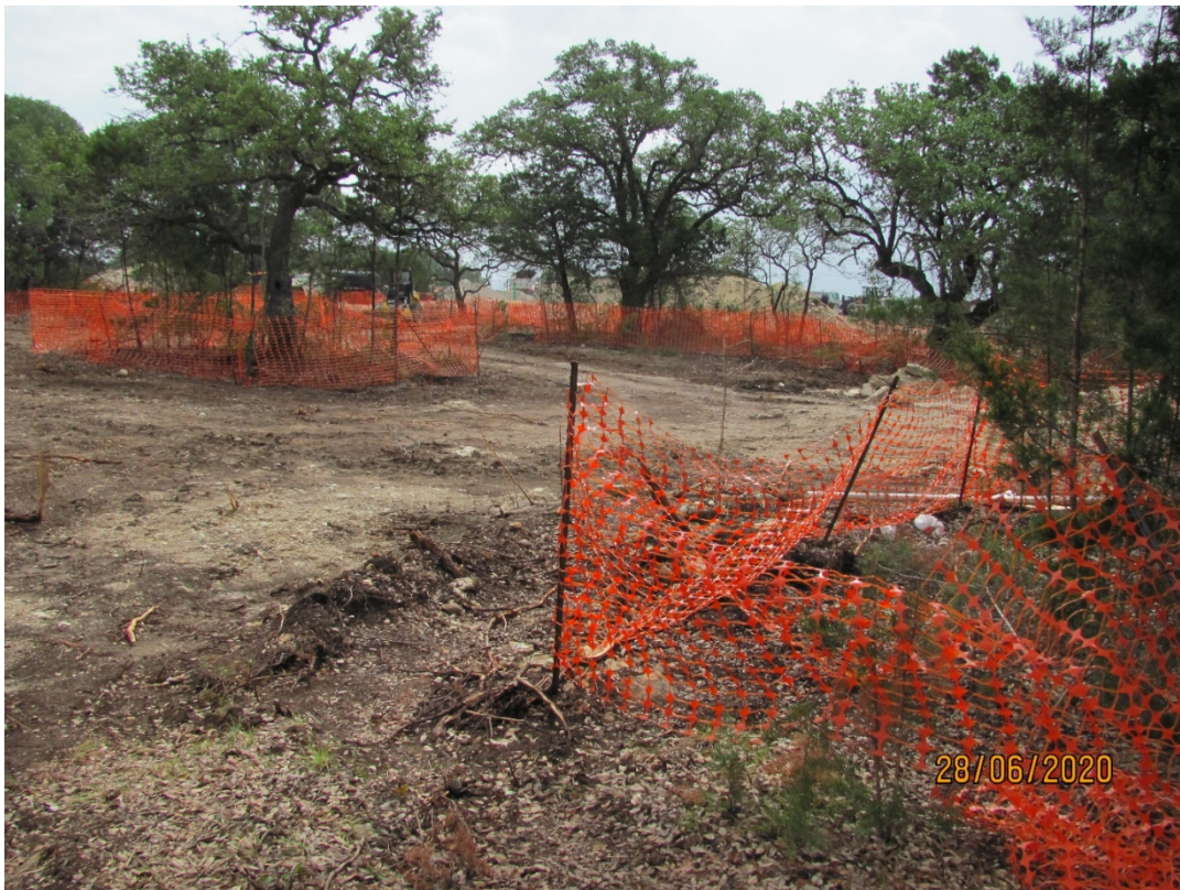
EXHIBIT 4 – TREE PROTECTION PER APPROVED TREE PRESERVATION PLAN