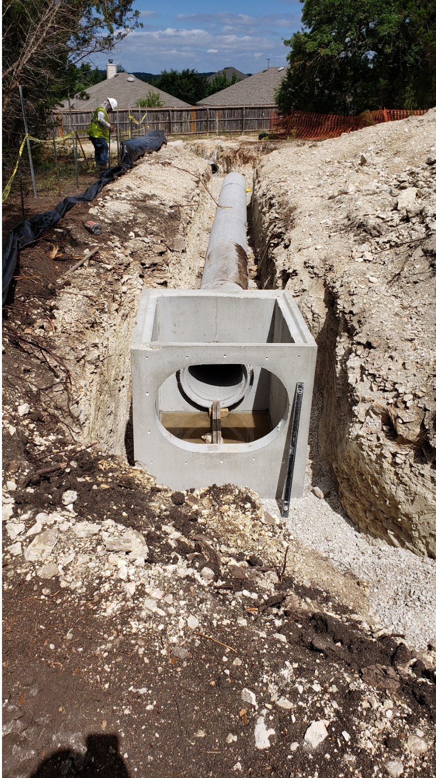
EXHIBIT 8 – STORM DRAIN → WEST IN KLABUNDE EASEMENT