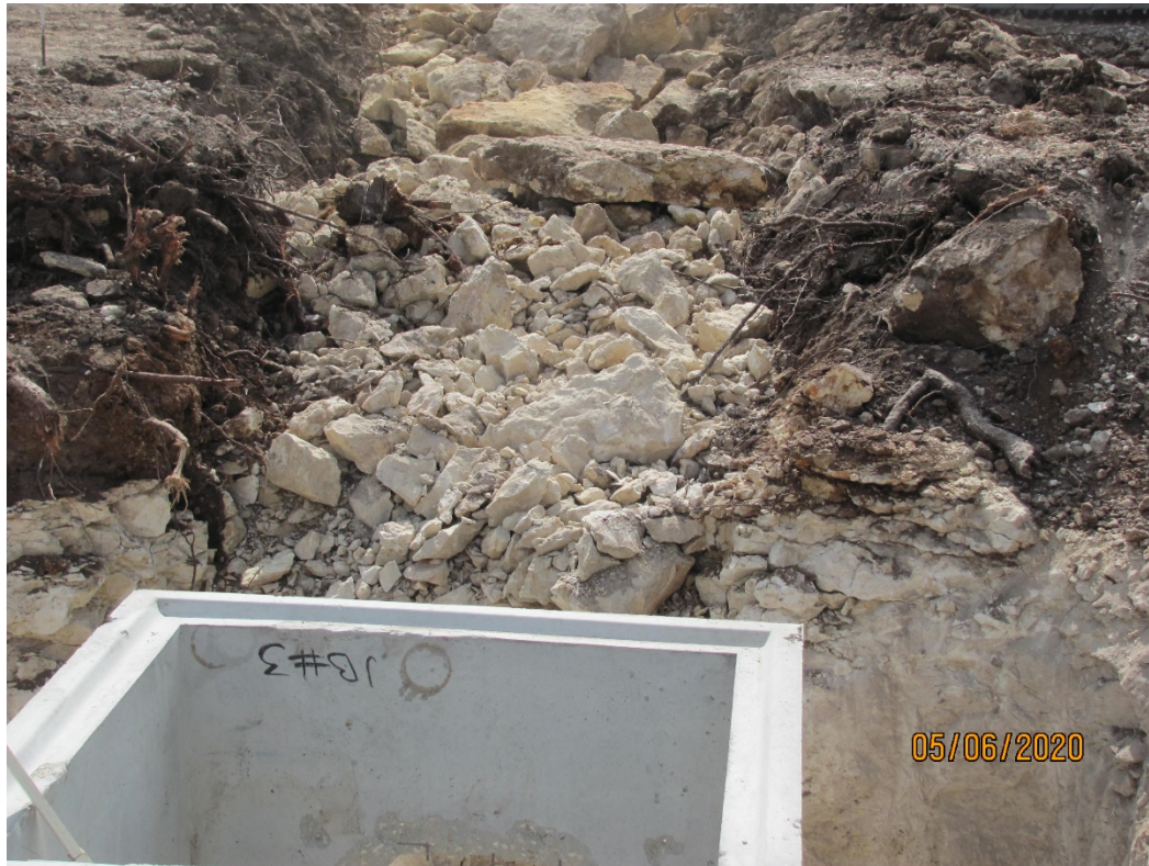
EXHIBIT 13 – SITE EXCAVATION IN ROCK