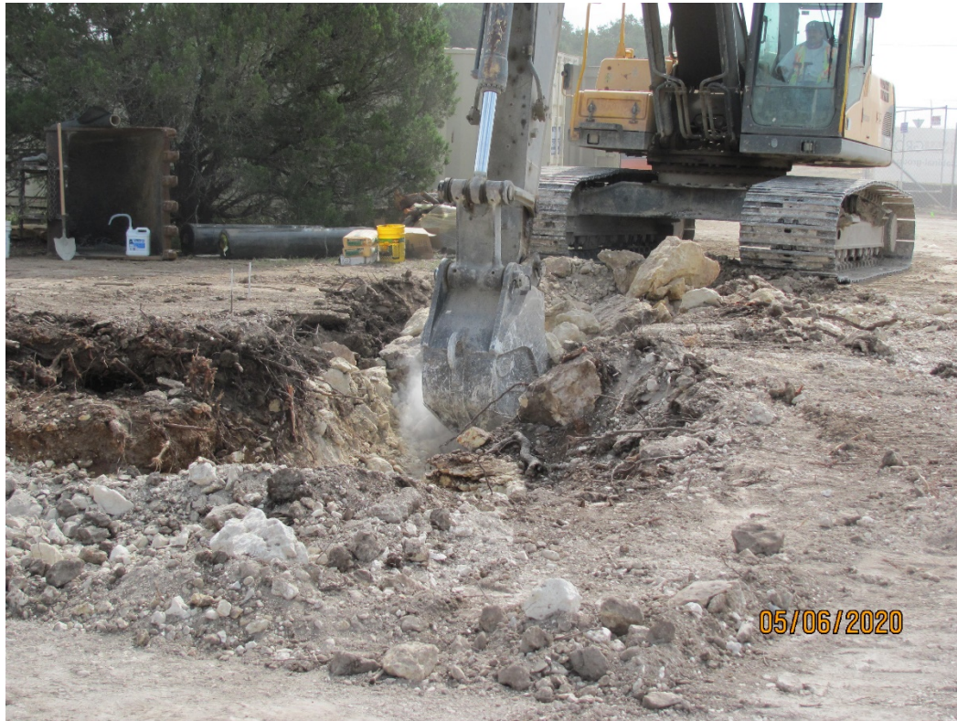
EXHIBIT 15 – SITE EXCAVATION IN ROCK