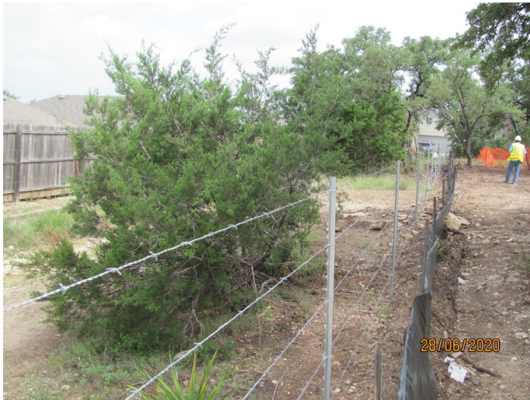
EXHIBIT 10 – 5 STRAND BARB WIRE → WEST PROPERTY LINE