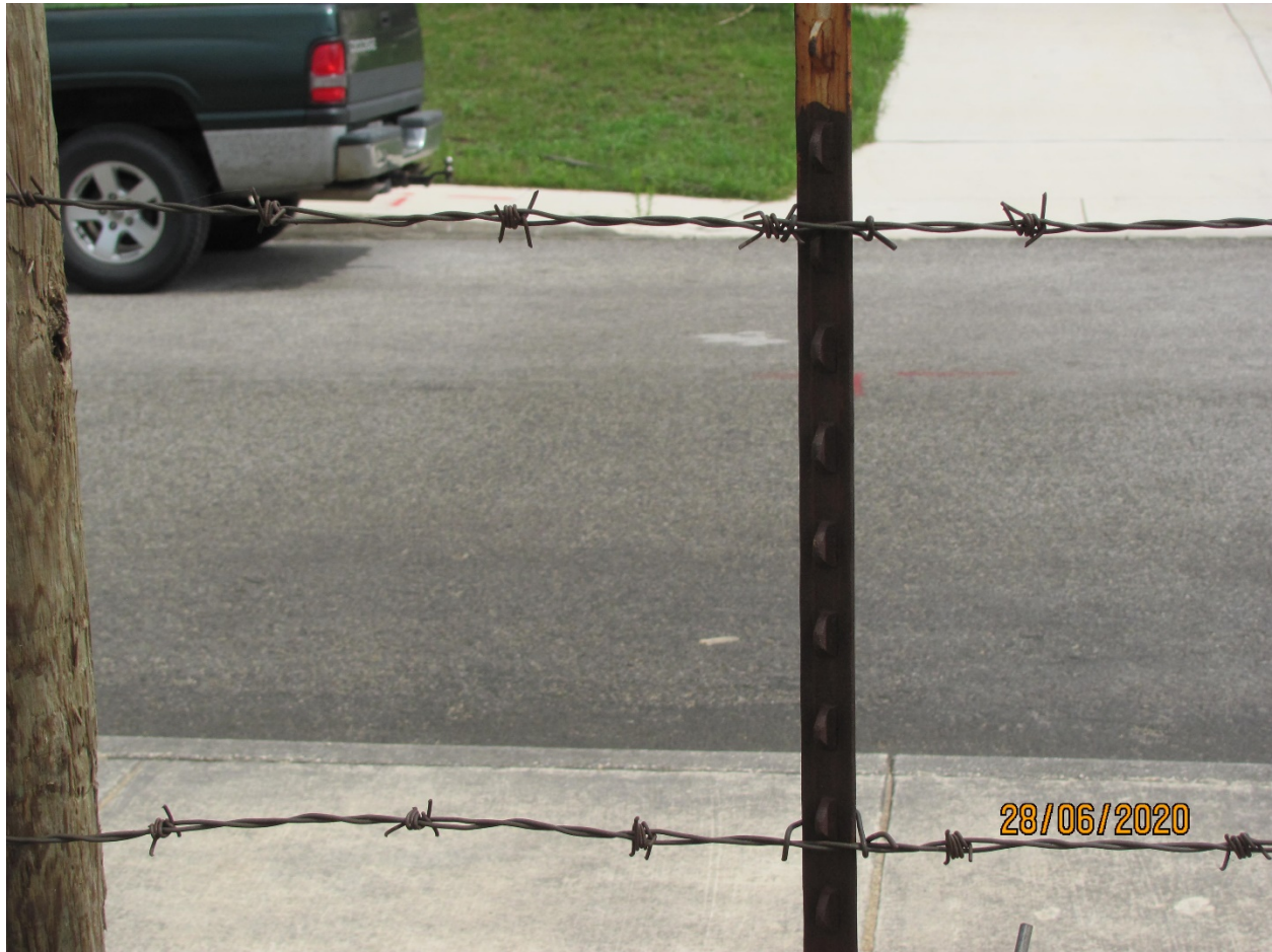
EXHIBIT 6 – PRESIDIO HAVEN SANITARY SEWER & WATER TIE INS