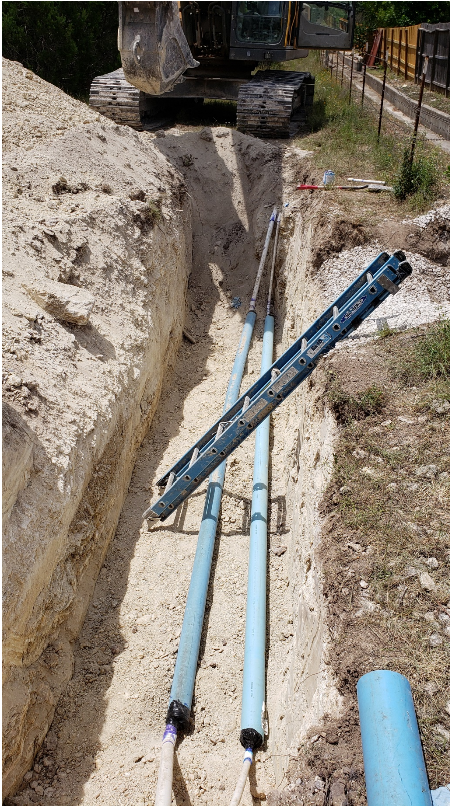
EXHIBIT 9 – KLABUNDE WATER SERVICE LINES RELOCATED