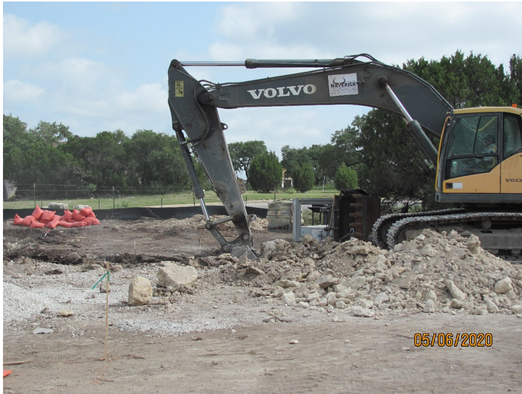
EXHIBIT 17 – SITE EXCAVATION IN ROCK