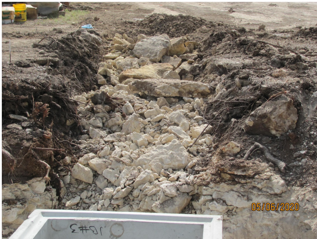
EXHIBIT 14 – SITE EXCAVATION IN ROCK