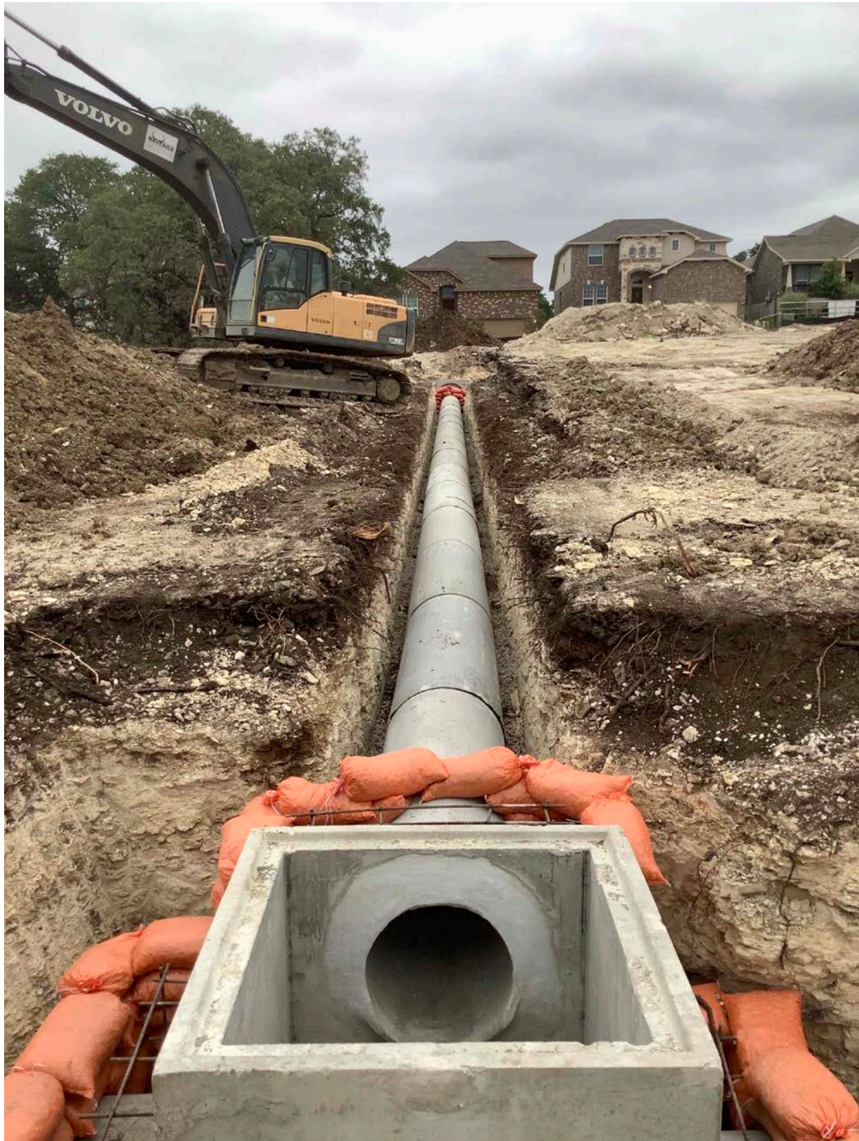
EXHIBIT 12 – STORM DRAIN → FACILITY NORTH TO PRESIDIO HAVEN