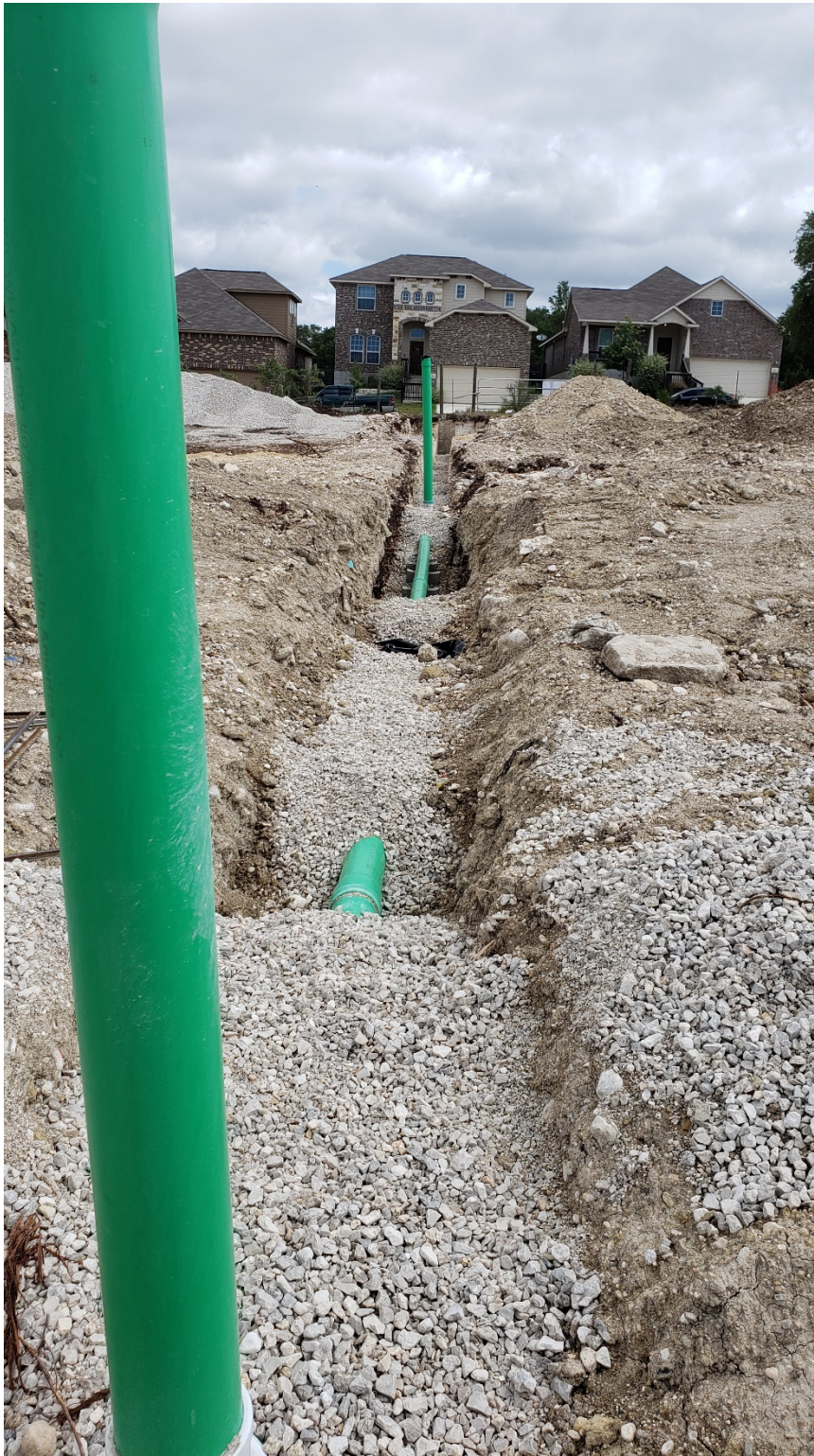
EXHIBIT 5 – SANITARY SEWER FROM FACILITY → NORTH TO PRESIDIO HAVEN