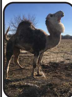
9 yr old Paint Male Camel

5 yr Geld Camel, 1 yr Geld Camel, Porcupines, Fox, young pair of black bucks, group of young Audads, Ring Tailed Lemurs- 6 mo male & 18 mo female, 20 plus head of Fallow Deer of all ages, Pair of Zebras, Chickens, Ducks, Turkeys, Geese and much more!