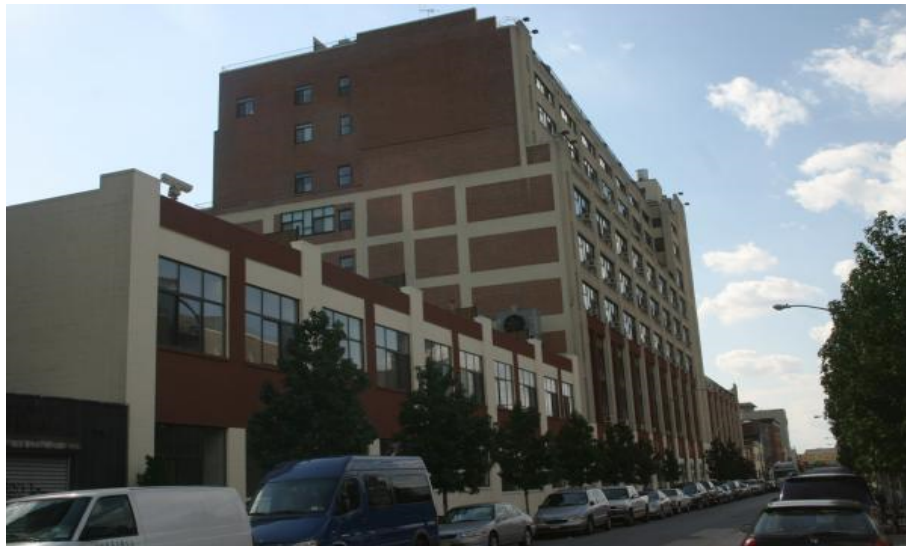
Building Exterior View from 535 Dean St