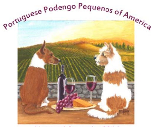
National Specialty 2016 Santa Rosa, CA