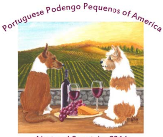
National Specialty 2016 Santa Rosa, CA