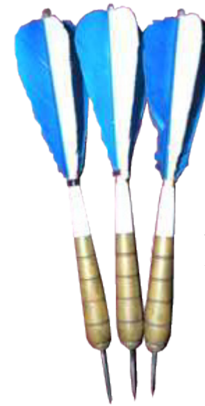
1968-70 Unicorn "Brass Bombs" 35 gms - feather flights

4660 Wilmington Pike • 937.296.1915 • www.kingspointpub.net