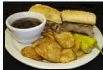
French Dip & Homemade Chips!