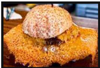
Our Famous Cheddar Melt!