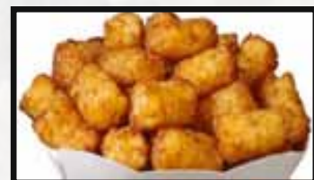
Even Tater Tots!