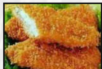
Golden Brownd Pollock!