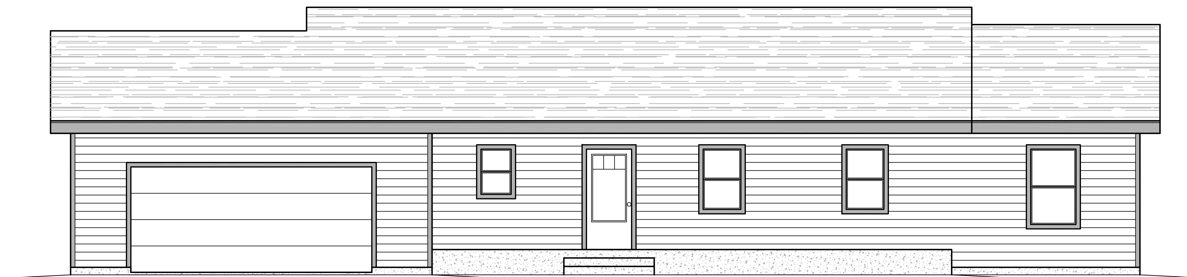
WEST ELEVATION (PREVIEW)

DRAWN FOR Helton Construction APRIL, 2014