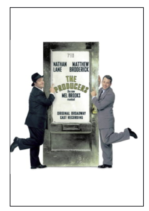
Sunday, June 24 at 7PM $10 admission

Lite Refreshments & Make Your Own Sundae