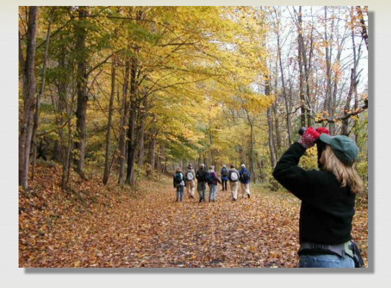
The Virginia Master Naturalist program transforms lives: our own, and those of the people and other beings that we serve under VMN.