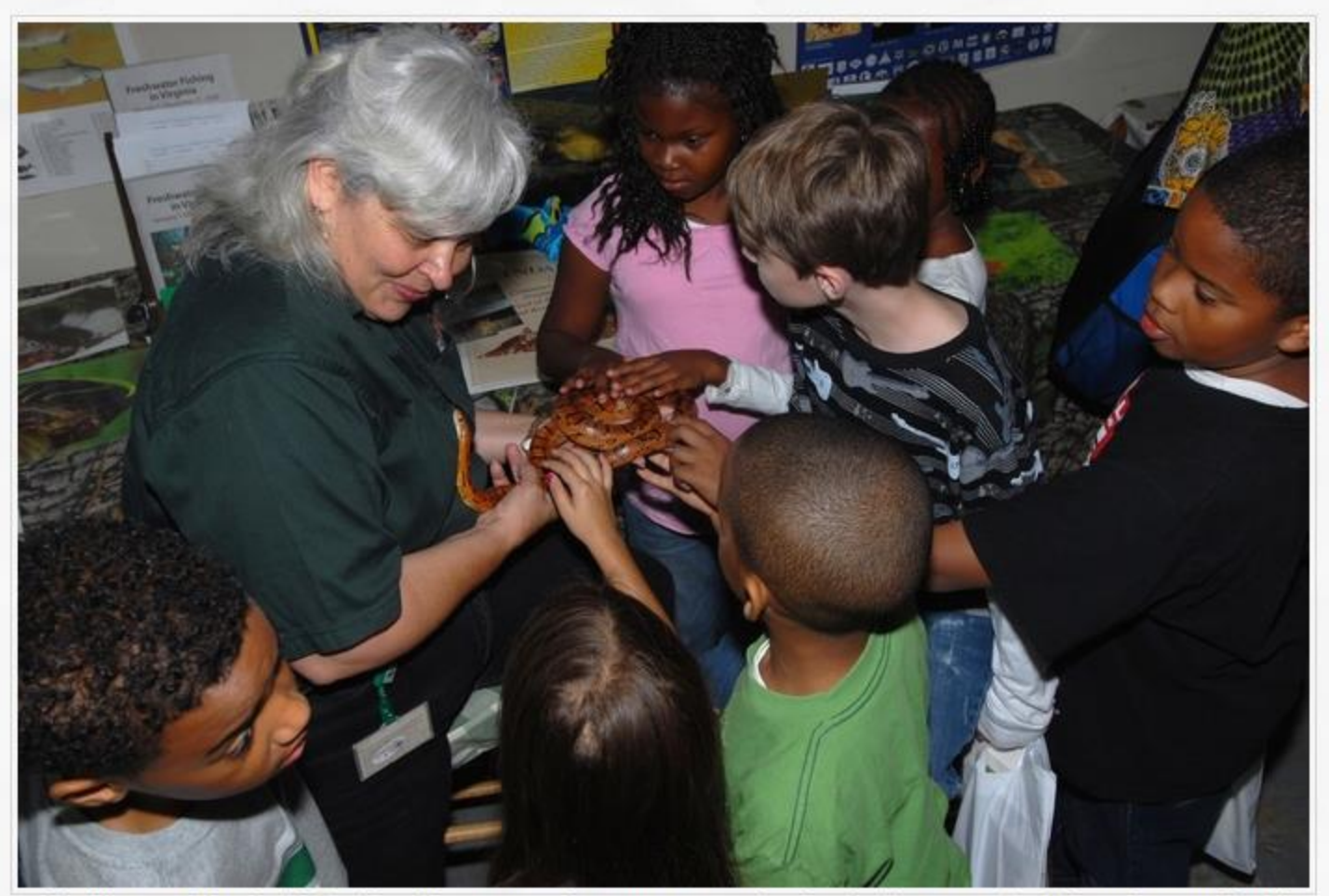
This fall VMN will work side-by-side with state natural resource personnel at the Virginia State Fair to help students and families experience Virginia's Chesapeake Bay and natural resources. Please consider signing up.

By Ann Regn, Virginia Department of Environmental Quality