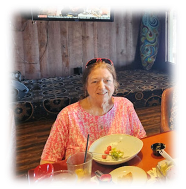
October 2023-Drunken Jacks, Murrells Inlet