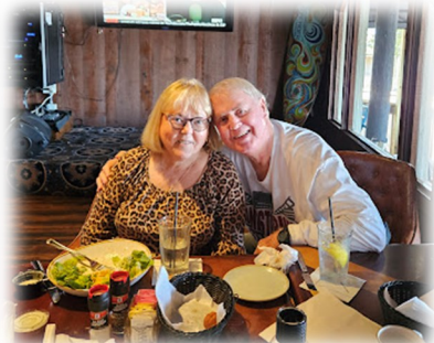
October 2023—Drunken Jacks, Murrells Inlet