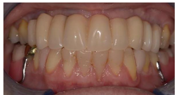
Fig 5- Final finished CAD/CAM milled Zirconia framework