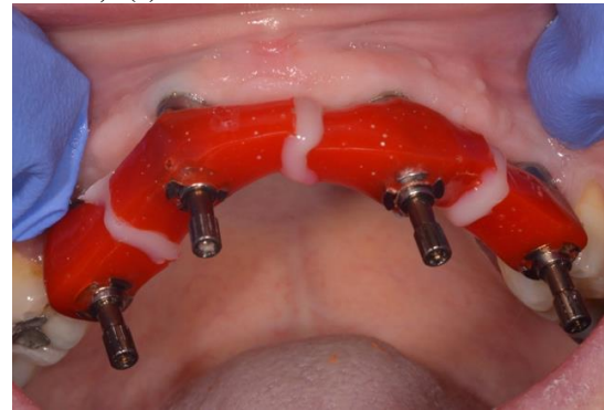
Fig 3- Verification Jig for Master cast

The choice of a fixed prosthesis would improve masticatory efficacy, retention, stability and support to improve patient comfort. Furthermore, cross-arch stabilisation and equal force distribution between the 4 implants was a major advantage. Even though the patient would compromise access for oral hygiene and is committed to a lifetime maintenance of the prostheses.