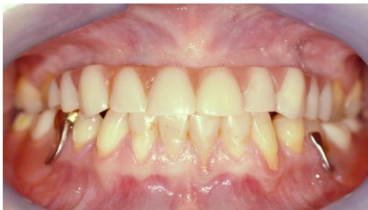
Fig1- implant retained hybrid bridge