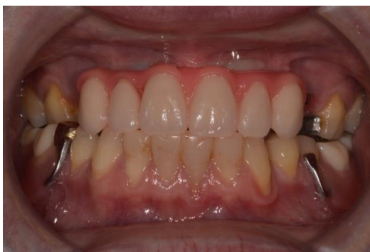
Fig 2- Mock-up with try in and confirmation of aesthetic design