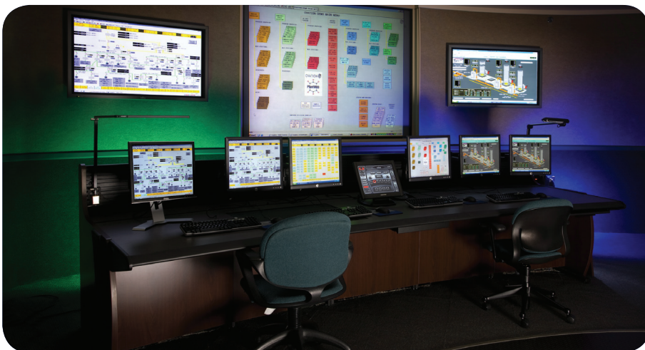
Upgrading the operator interface is a key component of any DCS upgrade as major improvements can often be made in this area with minimal disruptions to ongoing operations.

New automation system costs can be broken down into three main categories: installed cost of the new automation system, cost to train employees on new system, and downtime incurred while installing the new system. Installed cost includes all cost to purchase, test, install and start up the new automation system. In addition to these three main cost categories, there are other costs as summarized in Table 1.