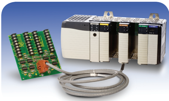
Automation system suppliers can often provide components that enable seamless connections from new controllers to existing I/O infrastructures, minimizing downtime during a DCS upgrade.

Once the operators are comfortable with the new HMIs, the simulation software can be uninstalled from the HMI PCs, and the PCs can be connected to the existing controllers. Depending on the DCS, this may necessitate some downtime, and may also require some programming to integrate the new HMIs with the existing controllers.