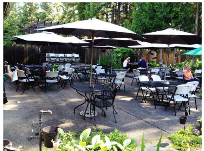
Outdoor seating at Takoda's Restuarant