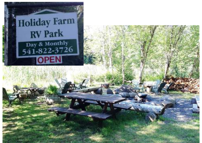
Fire pit and picnic area at Holiday Farm RV Park

We also scouted out the Holiday Farm RV Resort. The RV sites are nestled in a deeply shaded wooded area. Rates are $40 for an RV hookup. Tents are $10 if you double up with someone on an RV site, or $20 in the tent area. There is Wi-Fi, showers, and laundry facilities. Host Jim said our club had 9 of our 15 reserved sites already booked by rally attendees. Fire wood is free, although there is a $10 rental fee for the fire ring. Jim gave us a tour. There was a large outdoor fire pit surrounded by chairs with an adjoining picturesque pond. I asked Jim if our club could use the fire pit, and he said "sure." I asked if alcoholic beverages would be ok, and he said "We encourage it."