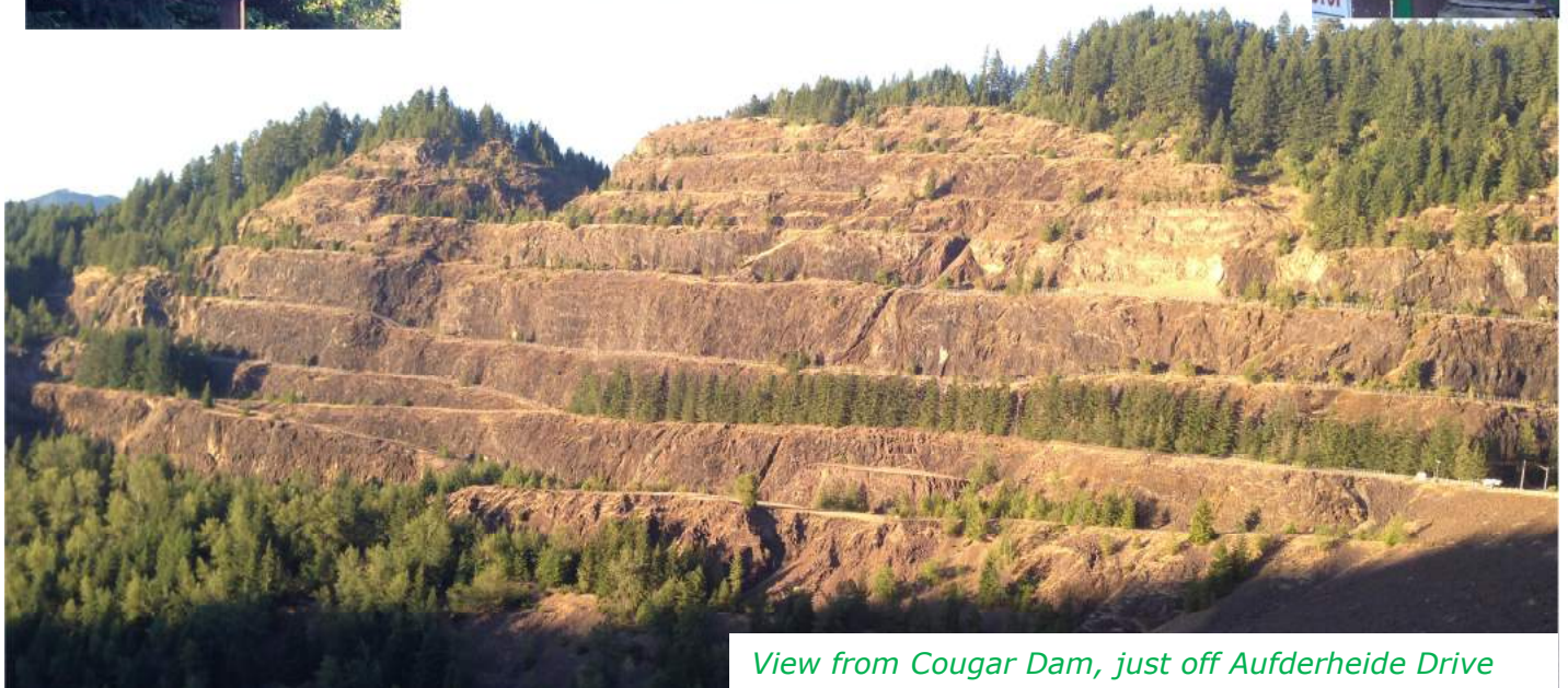
View from Cougar Dam, just off Aufderheide Drive