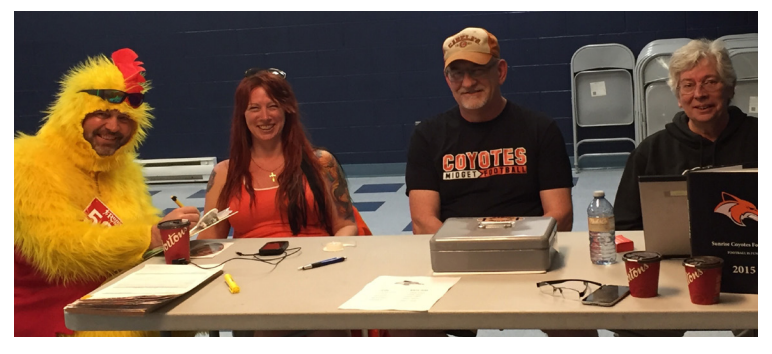
I think we all know why he crossed the road.

Donate here at https://secure.e2rm.com/registrant/Fund-raisingPage.aspx?registrationID=3652187&langPref=en-CA&Referrer=%26Referrer%3dhttps%253a%252f%252fadmin.e2rm.com%252fContentSelectPage.aspx#&panel1-3