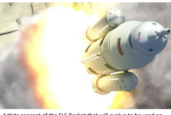
Artists concept of the SLS Rocket that will evolve to be used on future Mars missions

Unmanned Mission of the Orion Spacecraft around the Moon and back. This launch will require NASA's new megarocket – the Space Launch System, or SLS. The world has not seen a rocket of this strength since the Apollo spacecraft in the 1960/70's. EM-1 will be the test flight of this new rocket and the second mission for the Orion spacecraft. Planned launch of this mission is set for 2018. Stay Tuned!!