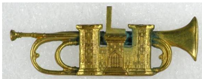
Insignia adopted by Engineer field musicians in 1905. This gilt insignia was worn on a dress uniform. Bronze insignia were worn on service uniforms.

The regulation of 26 Feb 1901, authorized 24 musicians that would form the Engineer Regimental Band. These men wore a castle superimposed over a lyre, all bronze on their service uniforms and a gilt castle superimposed over a silver lyre on their dress uniforms.