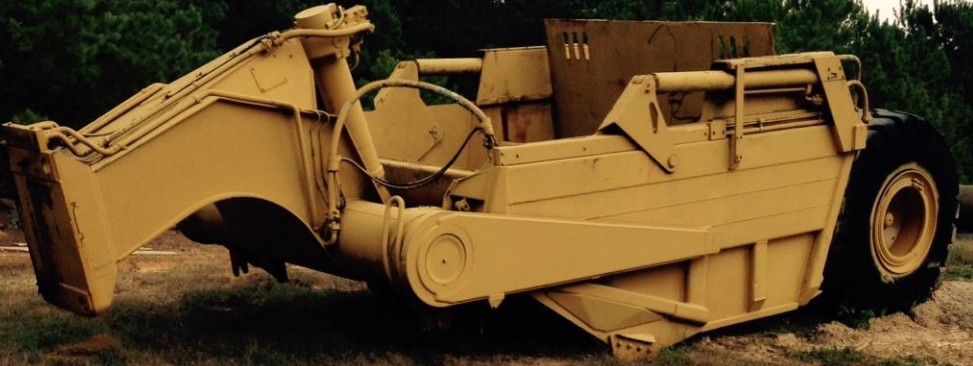
Left: The scraper pan needed to complete to the Museum's Clark 290M.