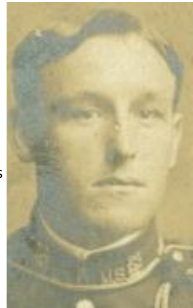
This musician played the trombone in the Engineer Band. On the collar (right) you can see the castle over lyre insignia.

The regulation of 26 Feb 1901, authorized 24 musicians that would form the Engineer Regimental Band. These men wore a castle superimposed over a lyre, all bronze on their service uniforms and a gilt castle superimposed over a silver lyre on their dress uniforms.