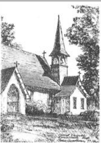
Christ Episcopal Church 220 Owensville Road West River, Maryland 20778